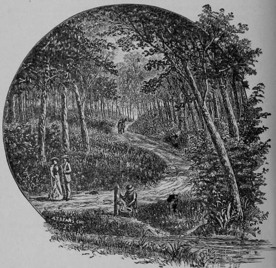
A DELL NEAR COLFAX, IOWA, ON THE "GREAT ROCK ISLAND ROUTE."