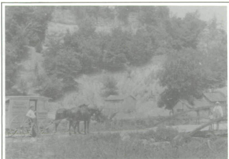
A traveling salesman arrives, Jones County, Iowa, c. 1920.