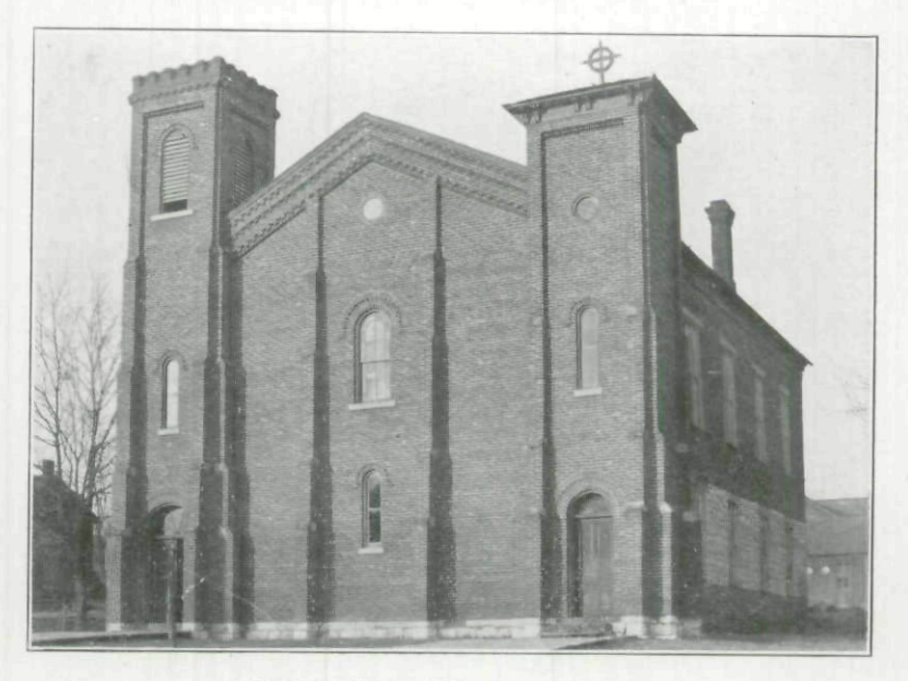
Methodist Episcopal Church erected in 1851 Old Places of Worship at Keosauqua, Iowa