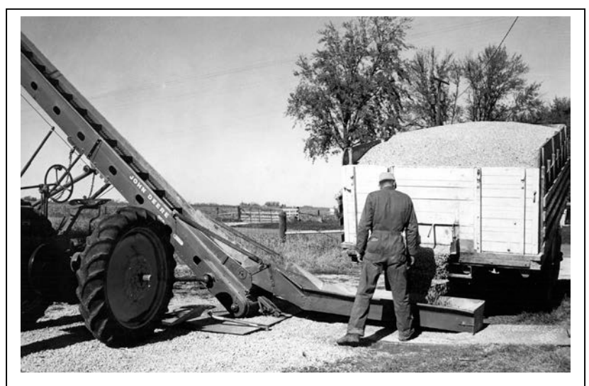
Grain elevators eased the arduous task of shoveling grain by hand. Unfortunately, farmers were sometimes caught in whirling PTO shafts or other rapidly moving of parts of such devices.