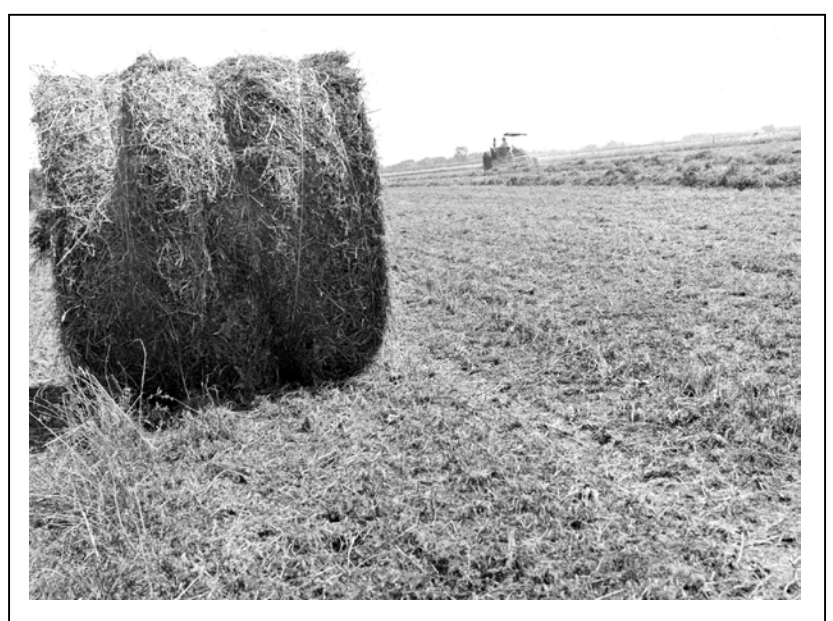
The appearance of big round bales represented the culmination of decades of hay-making innovations. Although such developments reduced physical exertion, they also altered work and safety conditions. Farmers had to exercise caution while operating round balers and transporting the weighty bales.

and crush farmers underneath their machines.<sup>40</sup> The slow implementation of safety features exposed farmers and their families not only to the dangers associated with unguarded moving parts but also to crushing injuries due to the lack of tractor cabs.