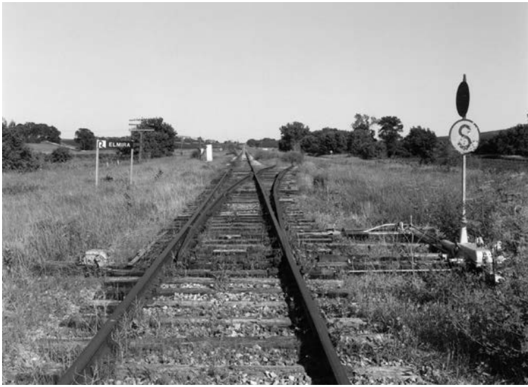
Abandoned track, Elmira, Iowa (June 1981). Located 9.4 miles northeast of Iowa City, Elmira was a busy junction – but never a town – that boasted a depot, freight house, two water tanks, and up to 60 passenger and freight trains per day in 1898. Fifteen months after the Rock Island closed in March 1980, all that was left were the Burlington–Minneapolis main track, a weedy passing siding, and a switch-stand and station sign well used for target practice by hunters.

THE ROCK ISLAND desperately needed the state funds. By 1974, the railroad had reached an endgame in its long-sought merger with the Union Pacific Railroad (UP). The ICC had approved the merger of the two properties (subject to stringent conditions imposed on both properties that would have, in effect, redrawn the western railroad map), but by the time the decision was announced in November 1974 the UP no longer wanted the Rock Island, whose infrastructure and track had decayed during the decade-long merger proceeding. 12 In anticipation of federal funding being available for reconstructive aid to railroads in the