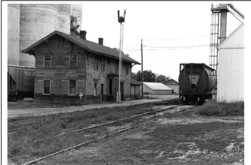
An original Burlington, Cedar Rapids & Minnesota station, built in 1871 at Greene, Iowa (October 1978). With the depot threatened by demolition in 1987, the town raised the money necessary to move it to a new site near the Greene Historical Museum.

IOWANS were deeply concerned about the Rock Island's failure, especially about how it would affect the state's economy and railroad service in the state. 23 As a potential long-term solution, in 1980 the state legislature created the Iowa Railway Finance Authority (IRFA) to provide for the financing of essential railroad lines and their rehabilitation under a grant program established by the legislature. The Ray administration and the legislature continued to seek innovative ways to keep rail lines in service in difficult times for the industry. 24