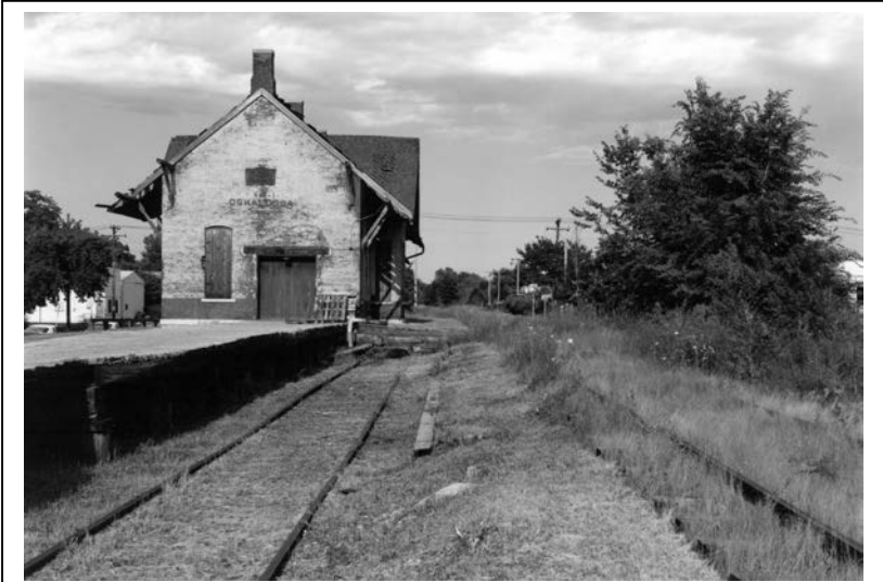
Abandoned depot and track, Oskaloosa, Iowa, photographed four months after the Rock Island had shut down (July 1980). The depot, built in 1887–88, was added to the National Register in 1990 and has been restored and reused as a restaurant. The tracks have been removed.