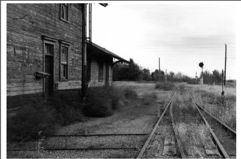
Abandoned depot and track, Shell Rock, Iowa, on the Rock Island's Burlington–Minneapolis mainline (October 1980). Successor Iowa Northern Railroad restored service to Shell Rock from Nora Springs one year later and reopened the entire line between Cedar Rapids and Manly in 1982. The depot (ca. 1872) is no longer extant.

from the state: the line between the Rock Island's main at Atlantic, Iowa, north to Audubon; the eleven-mile branch from Indianola to Carlisle in Warren County; and a 120-mile stretch of line between Iowa Falls and Superior in the north-central part of the state. All the lines met a cost-benefit threshold determined by the Rail Assistance Program, and each had important shippers who needed rail service and were willing to share the costs with state officials and the railroad. In preliminary discussions the state noted that the Rock's finances were such that it could not expect to contribute anything to the costs of rehabilitation at the moment, with promises of payments coming in the future.