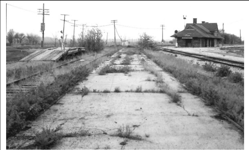
Abandoned depot and platforms, West Liberty, Iowa (May 1983). Freight service had resumed on the defunct Rock Island's former east-west main-line through West Liberty when this photo was made, but the depot and platforms remained abandoned and unneeded. Today the depot has been restored as a museum and houses West Liberty's Chamber of Commerce.

Although the plan was opposed by some railroads, such as the CNW, which called the plan "socialistic," other railroads removed their opposition. The Milwaukee Road, which hoped to gain trackage rights over the north-south spine line, dropped its opposition in May 1981. The Burlington Northern also saw the state's plan as a feasible way to handle the disposition of lines. The stumbling block remained the CNW, which intended to purchase the north-south spine line from the Rock estate. Besides worrying about the lack of competition if the CNW should succeed in gaining control of that line, state officials also worried that if the CNW was able to purchase the spine line from the Rock estate, the State of Iowa would be "left with the dog lines—and those lines would probably result in the state being unable to attract general partners and may result in the state being unable to divest itself of the lines in the future." 33