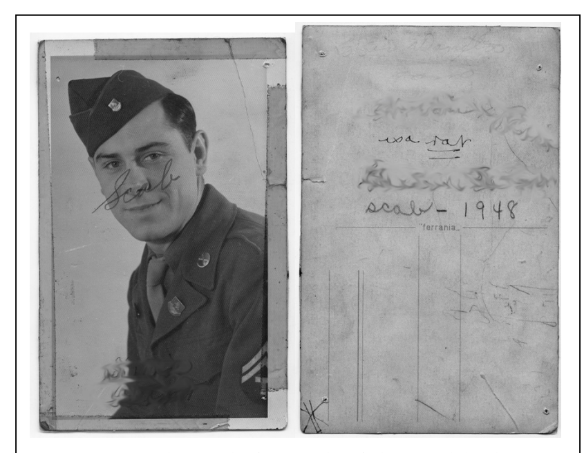
Fig. 11: Portrait photograph of a man identified as a strikebreaker, 1948. (Note: image altered by author to obscure name.) Striking workers repurposed a portrait made prior to the strike, using it to identify the man as a "scab." Identifications and defacement on front and back are written in multiple hands, indicating that the picture circulated among several users: Photo from UFCW P-3 Records.

they were going to go on to the plant, the strikers slashed their tires." <sup>22</sup> Supervisors and managers, too, sometimes found striking workers at their homes when they returned from work, sparking confrontations that occasionally became violent. <sup>23</sup>