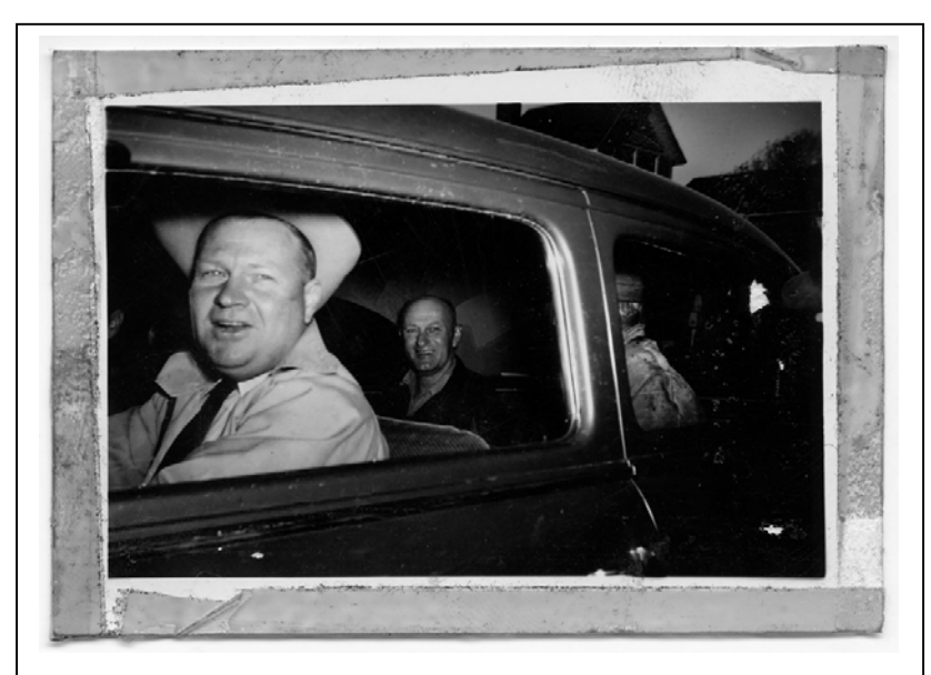
Fig. 9: Car containing strikebreakers, Cedar Rapids, 1948. The car's driver and passenger look at the camera laughingly, aware that they are being photographed but seemingly unfazed.

offer more than dispassionate recording of the situation: they were made in the thick of it by participants. A newspaper reporter or other nonparticipant observer might stand back, taking a picture with a wider angle that would encompass both crowds and vehicle. The individuals who made the pictures in the UFCW archive involved themselves in the action, standing among the people crowded around strikebreakers' cars, taking pictures with narrow, concentrated fields of vision. The resulting photos were more than basic snapshots. Makers of these images aimed not to document the situation for posterity but to capture pictures of the cars themselves, and of the people inside them, with the aim of identifying those people.