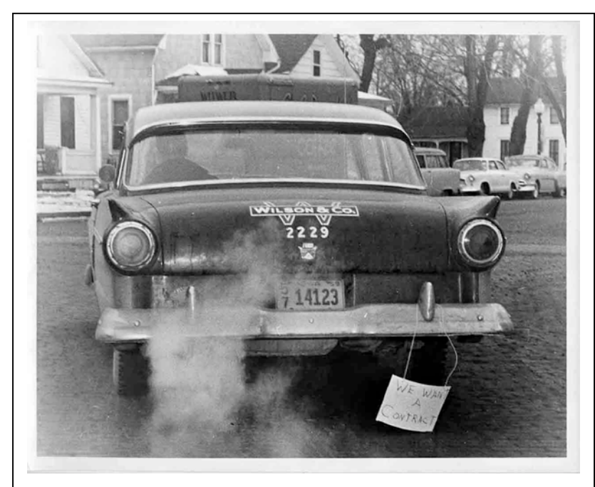
Fig. 5: A sign reading "We Want a Contract" was put on a Wilson company car by a striking worker. It is no wonder the union obtained and preserved a copy of this press image in its archives: by its very existence, the picture elevates the placement of the sign from a lark to a guerrilla protest action, memorializing the event and allowing it to live on after the fact.

open participation in strike activities such as picketing and leafleting. In a series from the 1948 conflict, groups of striking workers in Cedar Rapids face and pose for the camera (see, e.g., figs. 1, 2). The subjects know they are being photographed and have had time to arrange and prepare themselves to be depicted by someone they clearly see as a friend and ally. Some pose in front of the Local, others outside of makeshift picket shelters erected near the packinghouse. Their willingness to be photographed speaks not only to a desire to remember the strike but also to declare their participation in it, to see themselves and to be seen by others as active members of the strike community. As Rick Fantasia has noted, the structure and routine of strike activities—the