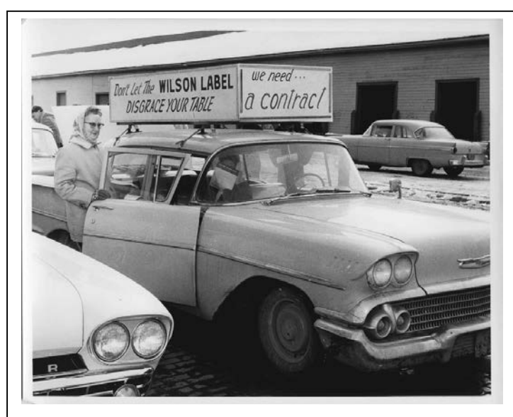
Fig. 18: Car carrying strike sign, Cedar Rapids, 1959. Wilson and Co.'s official slogan, "The Wilson Label Protects Your Table," is satirized in the sign attached to this car. This satirical riff on the company slogan was deployed widely among UPWA members in the early days of the 1959–60 strike. Wilson later mounted a successful legal campaign against the UPWA for copyright infringement, blocking continued use of the satirized slogan.

location, and the source, usually a media outlet. Some came from the Des Moines Register , others from the Cedar Rapids Gazette , still others from the Cedar Rapids-based TV and radio station WMT.