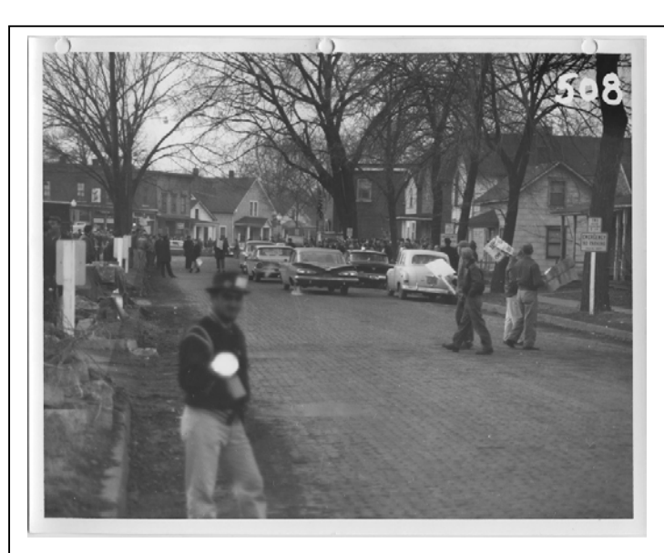
Fig. 22: Striking worker with flashlight, Cedar Rapids, 1959. The worker in the foreground points a flashlight not at passing strike-breakers but directly at the camera, apparently attempting (unsuccessfully) to "blind" the lens and foil the photographer's attempt to take his picture.

In some ways, the photographs in the Wilson/Farmstead Foods archive are similar to those collected in the UPWA/UFCW Local 3 archive. Both groups used pictures for identification: just like the pictures made by UPWA members, those collected by Wilson often have names written on the back or, in a couple of instances, directly on the front. But there are also significant differences in how the two parties made and used photographs. Whereas the union used the camera itself as an instrument of intimidation, making it clear to strikebreakers that they were being photographed, Wilson and Company preferred that striking workers not realize the presence of the camera. The company could make its case more easily if strikers did not know that they were being photographed, since awareness of the camera might change their behavior. Whereas striking workers wielded the camera openly, the meatpacking company preferred subterfuge, or at least subtlety.