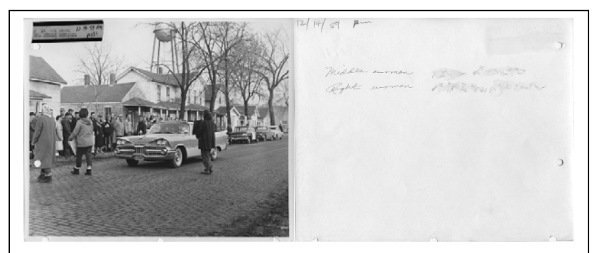
Fig. 19: Striking workers near cars of strikebreakers (front and back), Cedar Rapids, 1959. (Note: Image altered by author to obscure names.) Wilson and Company collected images made by news photographers and then used them to identify strike participants, writing names on the backs of many images. The label on the front of this image indicates that it was made by a photographer from Cedar Rapids media outlet WMT.

Carol Quirke demonstrates how such media biases betray themselves in subtly - or sometimes overtly - antilabor language in newspaper stories and image captions, as well as by arrangements of images selected for layouts.28 Indeed, as some of the images in the Farmstead Foods archive demonstrate, a news photographer's ideological point of view may reveal itself in the very choices—including physical point of view—made within the images themselves. Many of the pictures in this set show scenes similar to those depicted in the UPWA Local 3 photographs: striking workers picketing or surrounding the cars of strikebreakers. But, unlike the Local 3 pictures, it is clear that the press images were made by nonparticipant observers who stood apart from the action rather than inside of it. For a news photographer, the position of observer comes naturally; wide angles and distant vantage points connote neutrality and professional disinterest. But here, collected by the corporation, they also connote a passage of judgment on the activity being photographed,