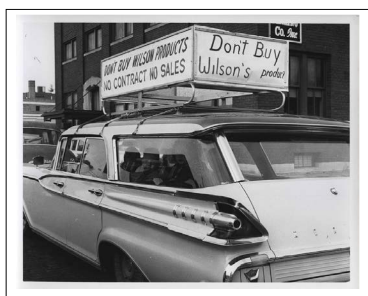
Fig. 16: Car carrying strike sign, Cedar Rapids, 1959. Collected by meatpacking company Wilson and Co., this photograph and others like it show cars participating in pro-union displays during the 1959–60 strike.

suggests that Wilson gathered them expressly as evidence. In part, they may have served to substantiate the company's claims in a lawsuit that it was pursuing against the UPWA for copyright infringement: the phrase "Don't Let the Wilson Label Disgrace Your Table," visible on some cars, derived directly from Wilson's official advertising slogan, "The Wilson label protects your table," and Wilson had filed a lawsuit against the UPWA to prevent its use (fig. 18). <sup>26</sup> But not every car in the photographs collected by Wilson bears this phrase or any other that might be construed as a satire of Wilson's slogan. This suggests that in collecting or commissioning the pictures, Wilson aimed to do more than just document misuse of copyrighted material. The company was gathering evidence of simple participation, potentially for purposes of retaliation against individual workers. From its