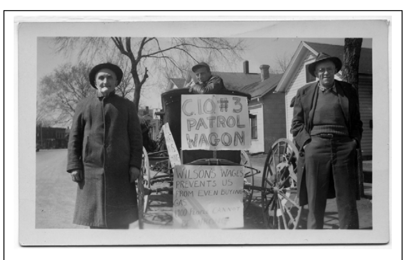
Fig. 4: UPWA Local 3 picketers and patrol wagon, Cedar Rapids, 1948. Attached to a horse-drawn wagon, the signs become these workers' mobile testament to the perceived stinginess of packinghouse management: "Wilson's wages prevents us from even buying gas."

The archive of UFCW Local P-3 at the State Historical Society of Iowa in Iowa City retains photographs from several labor conflicts, most in Cedar Rapids, with a few from nearby Waterloo. Many of these images derive from the industry-wide 1948 strike; others are from the 1959–60 strike affecting only Wilson employees. Where available, information about the photographs' acquisition and provenance—the source and history of the images—has been written on the archival sleeves that now house the pictures. For some pictures this information is augmented by writing directly on the images themselves. One may also glean a great deal of information simply by analyzing the pictures, which can sometimes tell their own stories independent of other documentation. The majority of the pictures were made by members of the union, but some appear to have been collected from outside sources. A few were either requested or purchased from local newspapers.