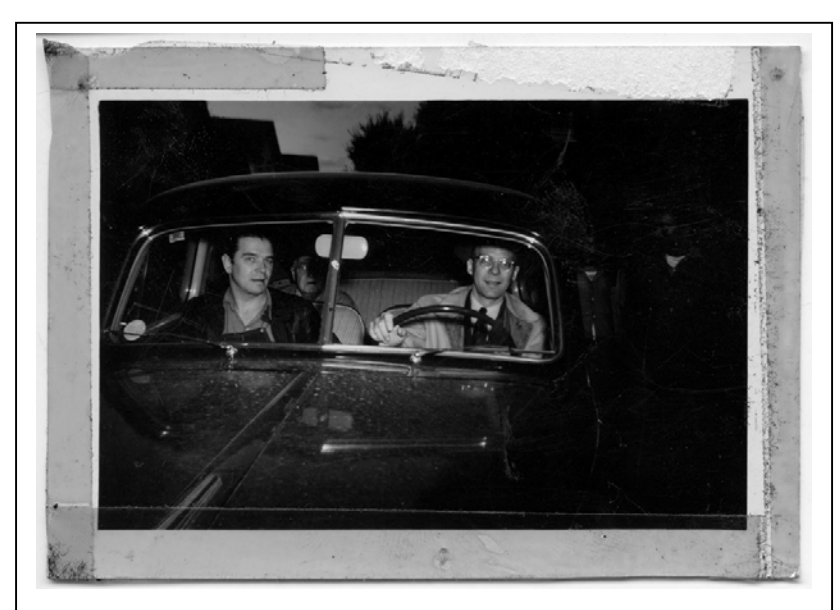
Fig. 7: A car containing strikebreakers, Cedar Rapids, ca. 1948. While making this image the photographer stood directly in front of the car. The intimidation implicit in the act of blocking the car's progress is compounded by the presence of the camera: the car's inhabitants not only know that they are being photographed, the photographer wants them to know.

the Wilson plant: "Wilson & Co. CLOSED for alteration of their thinking" (fig. 3). In another, a group sits in and stands around a horse-drawn cart, the back hung with signs reading "C.I.O. #3 Patrol Wagon" and "Wilson's wages prevents us from even buying gas" (fig. 4). Here, too, photographs record the presence and wording of the signs, and also function to build community among the participants. In photographing and being photographed, union members knew they were creating a persistent document of strike actions, carrying relevance of the events beyond the immediate, testifying to future viewers and union members about the sense of community among striking workers.