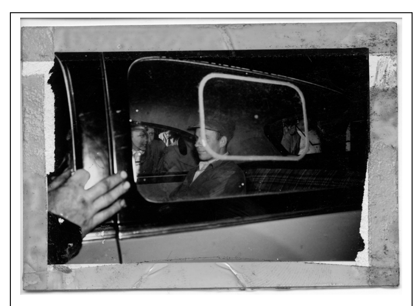
Fig. 6: UPWA Local 3 picketers near a car containing strikebreakers, Cedar Rapids, ca. 1948. The close range of this picture and others like it demonstrates that the image was made by a participant in the strike. The camera served as an active tool of identification and intimidation, a way for striking workers to show strikebreakers that they were being seen and that their actions would be remembered.

scheduling of picket, kitchen, and staffing duty at the Local—replaces the structure and routine of the workday and gives the difficult strike period a much-needed sense of regularity. Collective activities provide "a sense of mutuality and sociability," helping to engender and support "the intense sense of community nourished by the strike." <sup>20</sup> Posed photographs of striking workers do not simply record a community spirit that already existed—they do not just passively image a worker's preexisting identity as a loyal union member—the pictures actively create such individual and community identities, bringing them into being by giving them visible form.