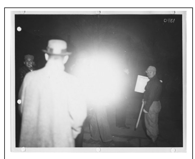
Fig. 24: Striking workers at night, one with flashlight, Cedar Rapids, 1959. Here a worker with a flashlight or camera flash has successfully obscured his own face, preventing the photographer from capturing his image. Nonetheless, the face of one nearby worker remains clear enough that the company was able to identify him and to write his name on the back of the image.

the back of the picture carrying his name (fig. 24).<sup>31</sup> These images demonstrate that the striking workers knew photography could be used as a weapon against them, just as they were in turn wielding it in their own efforts.