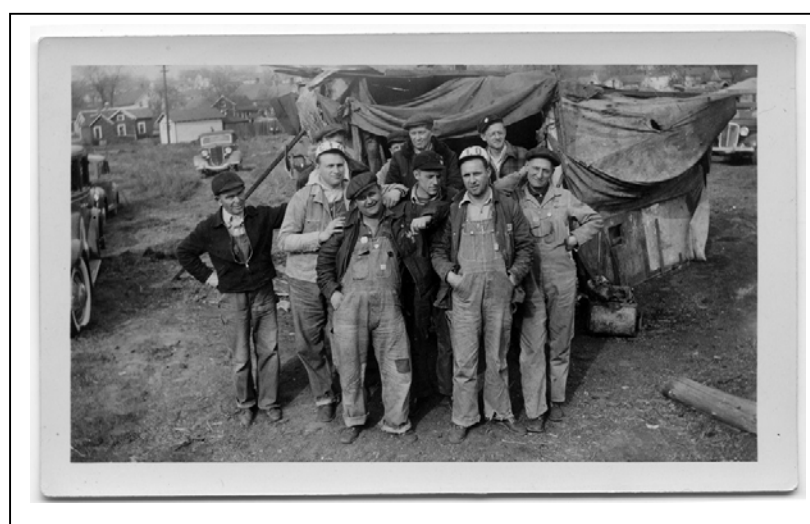
Fig. 1: Striking workers pose in front of a makeshift shelter, Cedar Rapids, 1948. These workers are aware that they are being photographed, and they regard the photographer as an ally. Pictures like this do not simply record the events of a strike; by giving visible form to a sense of camaraderie, the pictures help to bring the strike community into being.

sharply in Waterloo, home of the Rath Meatpacking Company, and in Cedar Rapids, where the local Wilson and Company plant was encouraged by its parent company in Chicago to maintain a hard line against strikers.