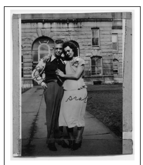
Fig. 12: Photograph of a man and woman identified as strikebreakers, 1948. A snapshot made for a different function has been repurposed to identify strikebreakers and has been displayed or circulated in some manner among striking workers.

or placed in a strike scrapbook. They clearly circulated among multiple users. One studio portrait, for instance, shows a man in military uniform. His name and other defacement have been written on both back and front (fig. 11). On the front, someone has written the word scab across his face. On the back, beneath his name, another person with different handwriting has inscribed the words is a rat. A second photograph from the same group depicts a man and woman embracing (fig. 12). Someone has written taunting epithets on the images of each: the word rat across his arm,