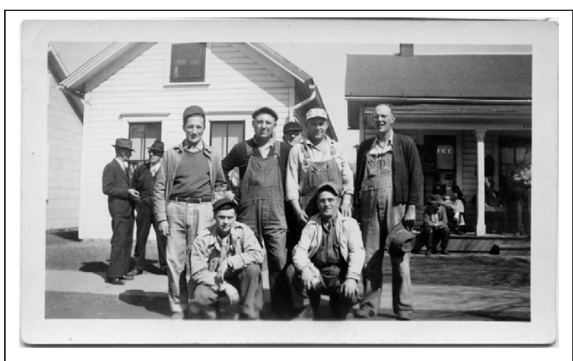
Fig. 2: Picketers from UPWA Local 3 pose in front of strike headquarters, Cedar Rapids, 1948. By posing for photographs such as this one, the participants declare themselves as proud, active members of the strike community.

One strikebreaker in Waterloo, encountering intimidation as he tried to drive into the plant, fired a weapon, killing a striking UPWA member and sparking a riot. In the short term, UPWA members received just a modest raise, but the union ultimately found its bargaining power strengthened by the strike, as the meatpacking industry came to recognize the desirability in subsequent negotiations of bargaining with labor rather than risking another strike.<sup>17</sup>