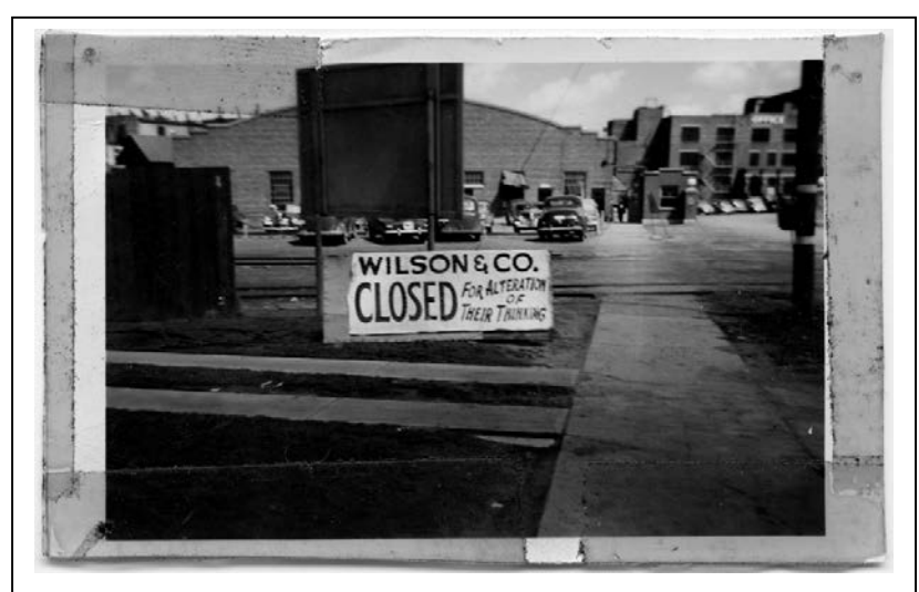
Fig. 3: Sign outside Wilson and Company from UPWA Local 3, Cedar Rapids, ca. 1948. This image and others like it testify to the cleverness of many protest signs and the boldness of the striking workers who placed them on or near company property.

members in other Wilson packinghouses followed suit. The strike was extraordinarily contentious, and incidents of violence and intimidation became commonplace. Wilson gained a reputation among packinghouse workers as "the most hostile adversary the UPWA ever encountered in its twenty-five-year-existence." The company refused to bend to workers' demands and issued threatening memos to strikers that came to be called "Dear John" letters. At strike's end, the company conceded little, though workers did retain the right to resume the same jobs at the same level of seniority as they had held prior to the conflict. 19