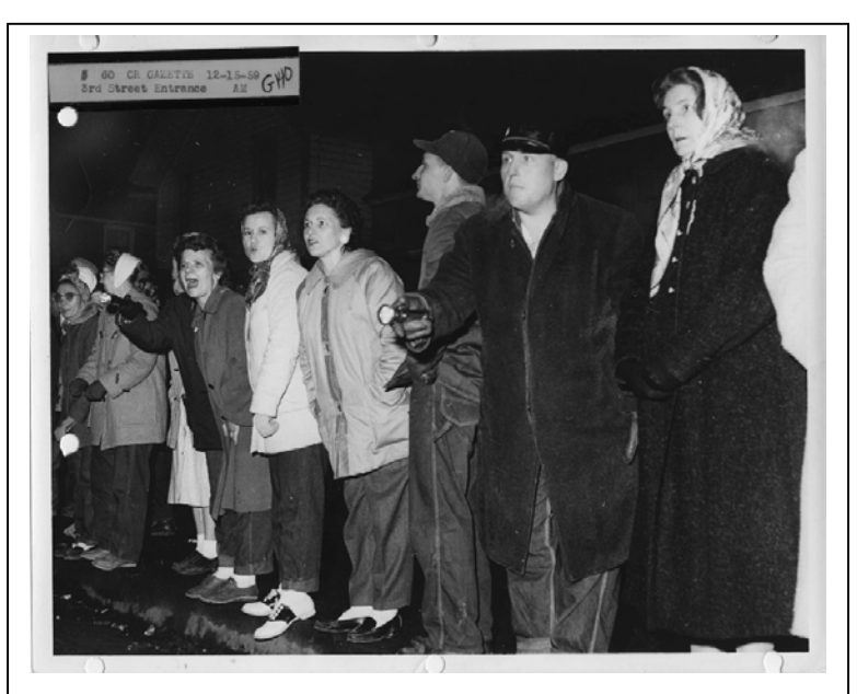
Fig. 21: Striking workers looking at strikebreakers in passing cars, Cedar Rapids, 1959. Made by a photographer from the Cedar Rapids Gazette, this image shows one subject pointing a flashlight toward passing cars, presumably shining a light on the strikebreakers within.

acquired by the meatpacking company, the pictures took on evidentiary value. If the participants identified in the images were later to be discharged by Wilson, or at least denied a return to their former job at the same pay and seniority scale, the photographs would become yet a third thing, offering justification for the decision.<sup>30</sup>