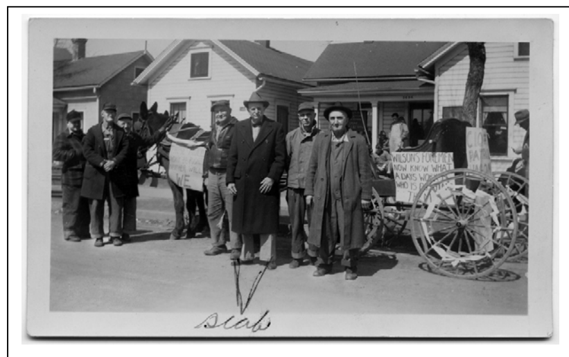
Fig. 13: UPWA Local 3 picketers and strike wagon, Cedar Rapids, 1948. One individual shown in the image has been singled out as a "scab" by a commentator. Presumably the individual in the picture was initially on strike, or at least sympathetic to the strikers, before deciding to cross the picket line and return to work. The handwritten annotation serves to set the record straight.

(who also happened to have a pen handy) felt that was not the case. A great deal of emotion is bound up in this marked image: the sense of pride in labor organization that drove the creation of the picture; the potentially wrenching decision by one individual to return to work; the fury of others at the disruption of community, at what they saw as disloyalty both to them as individuals and to the union as a whole. Initially created as part of an effort to create and maintain solidarity among people in a difficult situation, with its handwritten epithet the image elides an entire narrative into its small frame.