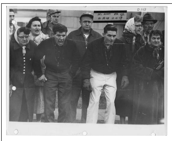
Fig. 20: Striking workers shouting at strikebreakers in passing cars, Cedar Rapids, 1959. The label on the front of this picture indicates that Wilson and Company obtained it from the Des Moines Register. It, too, has the names of some subjects handwritten on the back.

a distancing of the photographer from the object depicted. The clarity of the detached, middle-distance vantage point also permitted company managers to identify as many of the striking workers as possible.<sup>29</sup>