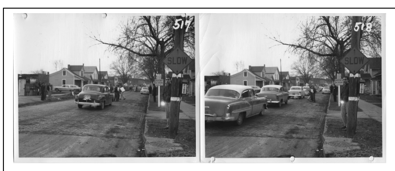
Fig. 23: Two images show a striking worker with a flashlight, Cedar Rapids, 1959. In both of these images, a worker at the right side of the image in the near-middle ground (next to the light pole) points a flashlight toward the camera in an unsuccessful attempt to "blind" the lens, even as he turns his face away from the camera to shout at cars driving into the packinghouse.

Still, looking at the pictures in the Wilson/Farmstead Foods archive, it is clear that many striking workers did know they were being photographed, if not by company representatives – that is, by the enemy – then at least by newspaper reporters or by unknown parties with unknown motives. Some strikers even attempted to avoid being imaged, aware of the potential for the pictures to become evidence against them. Many striking workers carried flashlights – simply to see in the dark, of course, since the strike occurred during the winter months when dawn came late and dusk early - and also to peer into the automobiles of strikebreakers (fig. 21). But photographs indicate that they also used their flashlights deliberately to "blind" the camera by pointing the lanterns directly at the lens (fig. 22). One sequential pair of images, for instance, shows a striking worker who wields his flashlight even though it is not dark outside and keeps pointing it toward the camera even as he turns to shout at passing cars (fig. 23). This suggests that he was employing the flashlight solely in an attempt to disorient the photographer and disrupt the picture so that he could not be properly seen. As these images also demonstrate, however, the strategy did not work all that well. Only one picture in the set shows evidence of a successful "blinding" of the camera, and even then one subject remains identifiable,