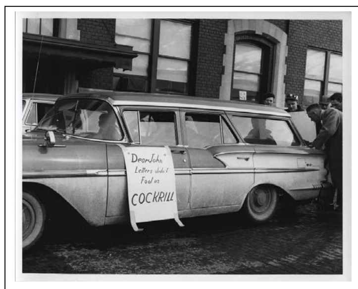
Fig. 17: Car with strike sign, Cedar Rapids, 1959. This picture, collected by Wilson and Co., shows the car of a strike sympathizer as well as the faces of some men gathered around it. An accompanying memo on Wilson letterhead states that the pictures were to be sent to a company attorney.

perspective, to ride in or drive a sloganized car constituted an endeavor to undermine the company, and these photographs served as proof.