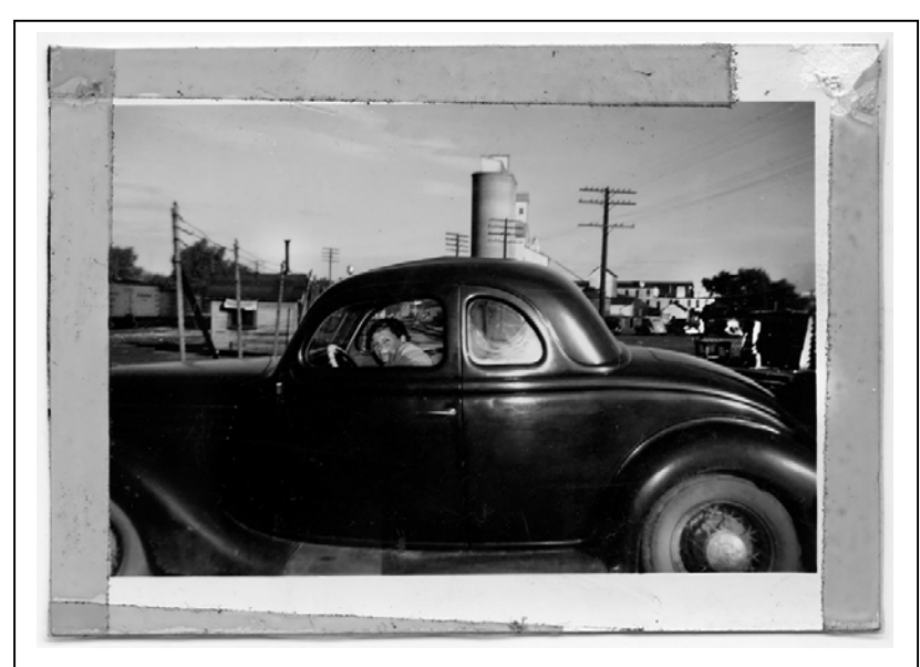
Fig. 8: Car containing a strikebreaker, Cedar Rapids, 1948. The driver of the car appears to duck down in the hope of avoiding recognition or evading the camera.

unsuspecting driver carries it away with him like a "kick me" sign (fig. 5). John McIvor, photographer for the Cedar Rapids Gazette , made the picture, which appeared in the paper in late November 1959 with the caption "Unwitting Picket." <sup>21</sup> Without the picture, the action would exist only as rumor and memory, reading as a lark and living on as a funny story. The news photographer's picture, however, makes the event persistent, multiplying its impact. It is easy to see why union members would have wanted to collect this image and keep it at the Local's headquarters: the picture raises the illicit sign from a juvenile hack to a protest action.