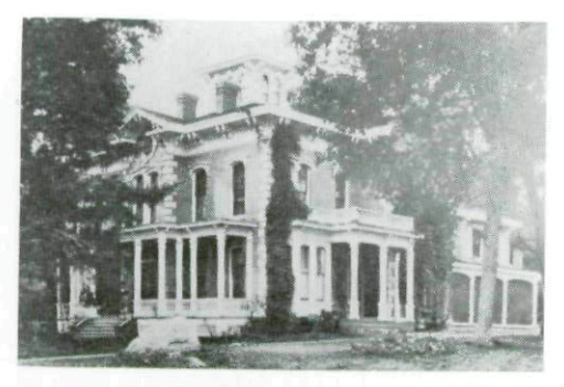
Figure 4. Picture of Flynn home around 1900. Note the heavier growth of trees compared to Figure 3, the time is about 30 years after picture in Figure 3. This picture appeared in MIDWESTERN MAGAZINE, May 1907.