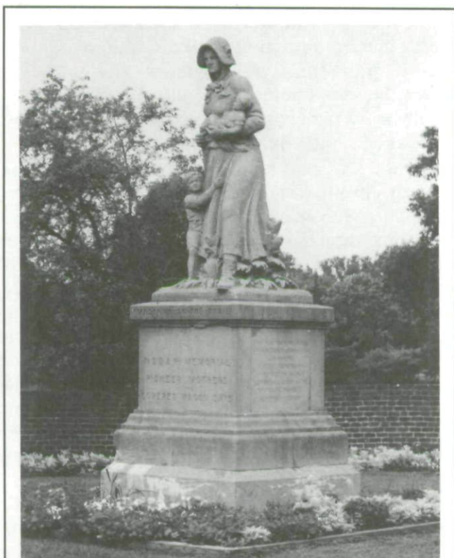
This Pioneer Mother of the Trail statue is located on the Old National Road near Springfield, Ohio.

ANOTHER FACTOR in the DAR's growth in Iowa was the DAR's engagement in a wide range of nonhistorical activities under the broad rubric of promoting patriotism. These various projects, like the promotion of the history of white settlement of the West, did not require the presence of Revolutionary landmarks.