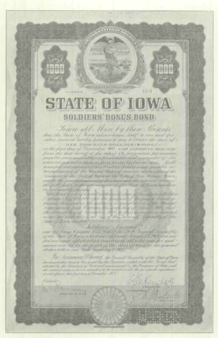
From a photograph of bond No. 4401, reduced in size, of the Bonus Bonds issued December 1, 1922. Redeemed December 2, 1927, and now in the office of the Treasurer of State.