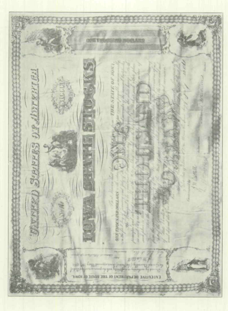
From a photograph of bond No. 160, reduced in size, of the issue of 1861. Redeemed and now in the Public Archives Division of the Historical, Memorial and Art Department.