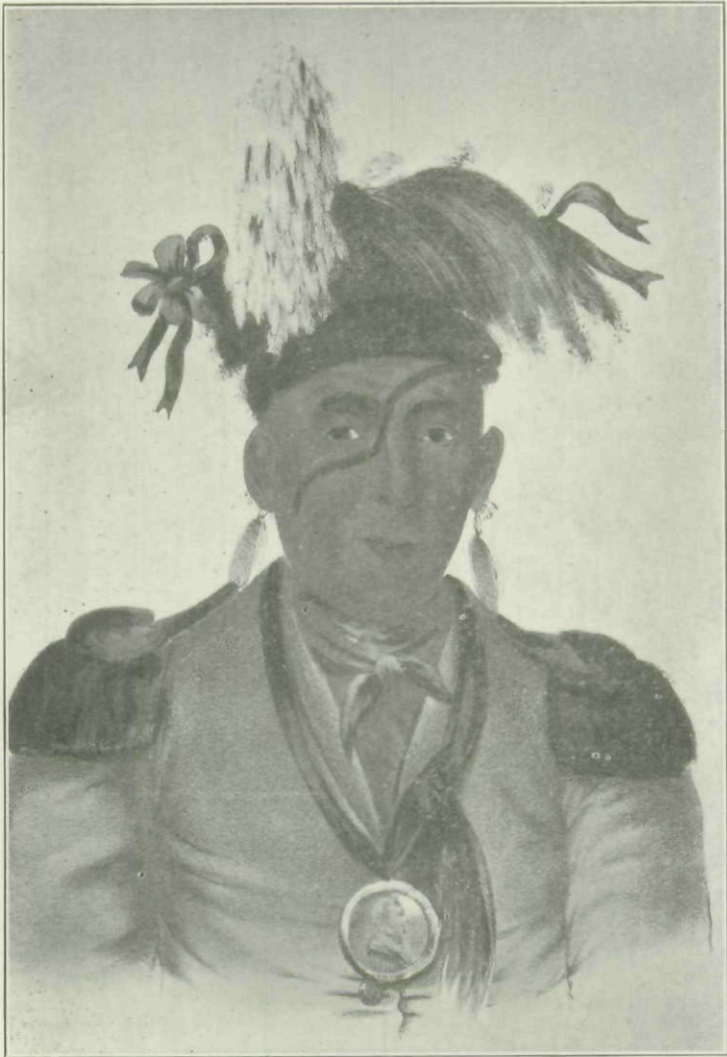
WABAUNSEE, POTTAWATTAMIE CHIEF

From a portrait in colors as reproduced in McKenney and Hall's "History of the Indian Tribes of North America."