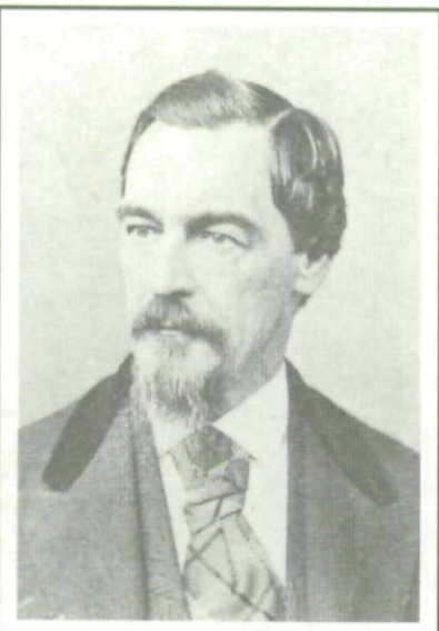
William Penn Clarke.

central committee, and read law. A rising figure within Iowa's Whig party, Clarke was the quintessential Whig in many ways. But in September 1848, disgusted with his party's waffling on slavery extension, he defected to the accumulation of abolitionists who made up Iowa's tiny Free Soil movement. The Free Soilers' first "high-profile" acquisition from either major party, Clarke promptly became their most prominent leader. 12