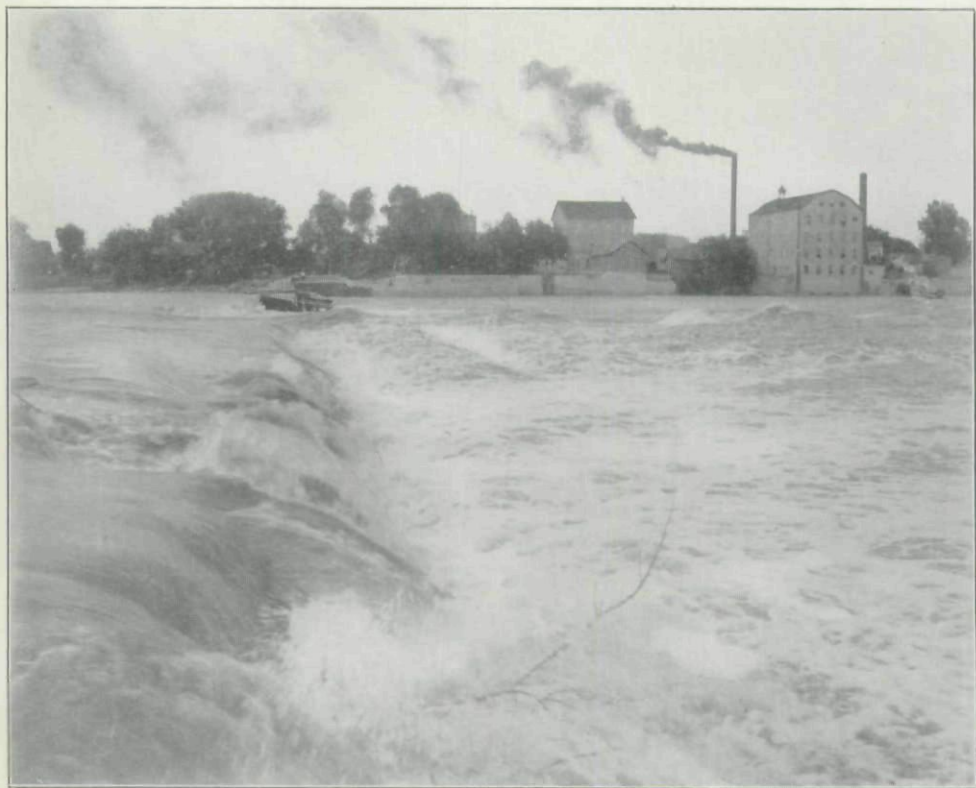
RUINS OF BONAPARTE DAM AS IT NOW APPEARS.