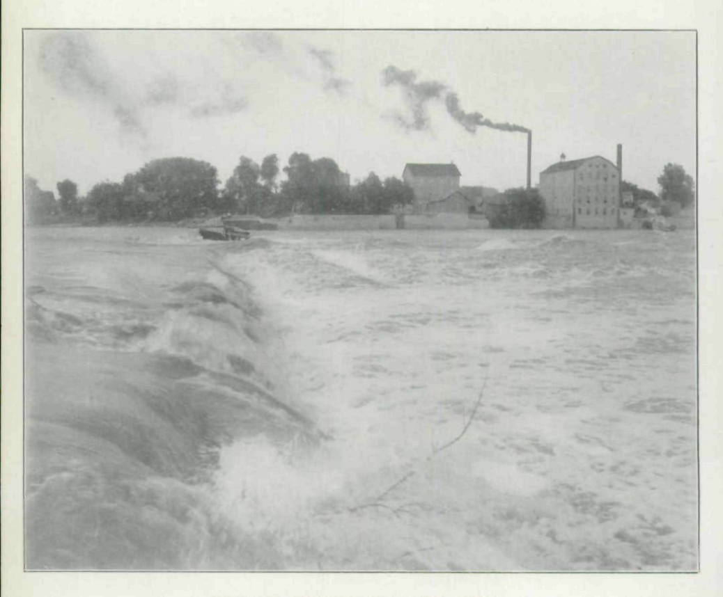
RUINS OF BONAPARTE DAM AS IT NOW APPEARS.