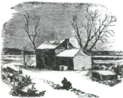
Old Indian Agency at Des Moines