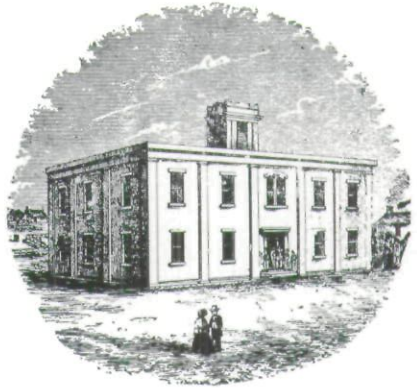
First Public School building in Des Moines, at 9th and Locust built in 1855, cost $11,000