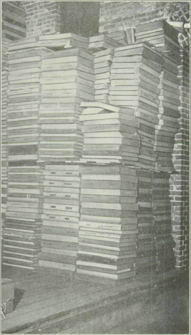
A portion of the 2,341 volumes of non-Iowa papers, in storage, and inaccessible.