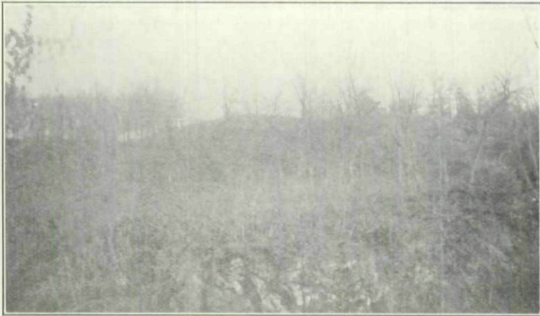
Pettinger bog near Ames, covered with willows of several species, mainly beaked willow. Peat in the foreground, this peat being present back of ditch. Oaks, maples and elms in the background. Several buffalo horns and skeletons were found here from 1880 to 1923.