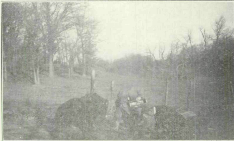
Pettinger bog near Ames, looking northeast, with side hill covered with oak, elm and hickory.