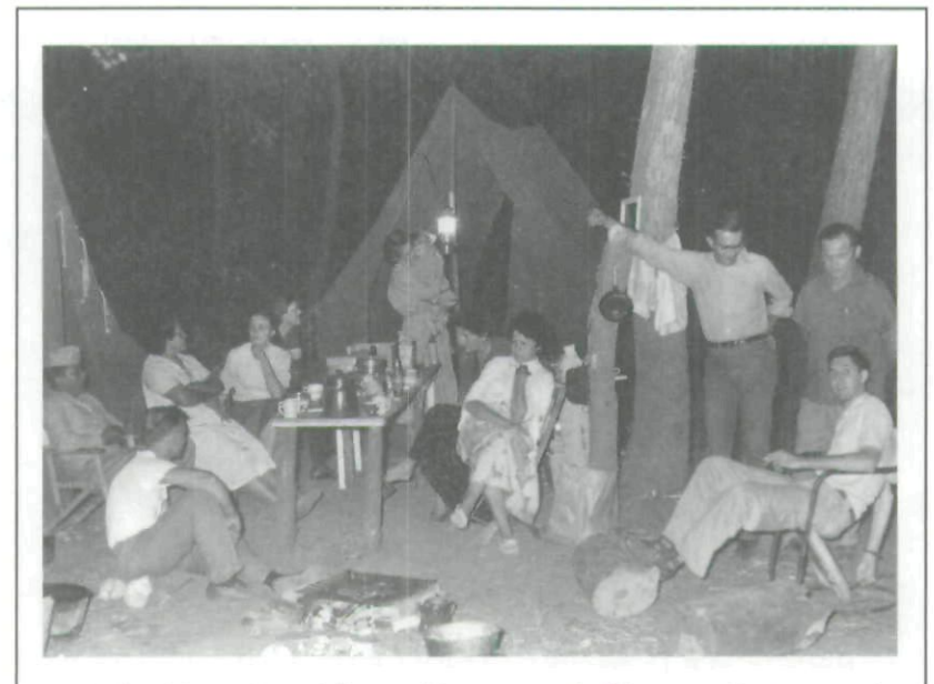
A Meskwaki couple socializes with a group of Chicago students around a campfire.

the women involved in the project. "I miss their friendship, just being able to talk with them and learning their side of the world, their travels," she said.<sup>29</sup>