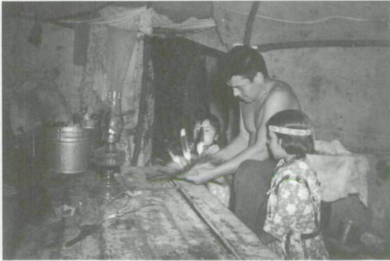
This photo of a Meskwaki man and his children in their wickiup illustrates typical living conditions on the Meskwaki Settlement at about the time the Chicago students arrived.

the military or did not work in town had little contact with whites. The Bureau of Indian Affairs did little for the people except run the settlement's day school and arrange for medical care through a contract with a local doctor. Settlement residents possessed one important asset, their land, which their ancestors had purchased in 1857 after trickling back from a Kansas reservation to which the federal government had sent them. The Meskwaki land purchase conferred on the Meskwaki the status of communal landowners, unlike most Indian communities whose reservation land was owned by the federal government. 9