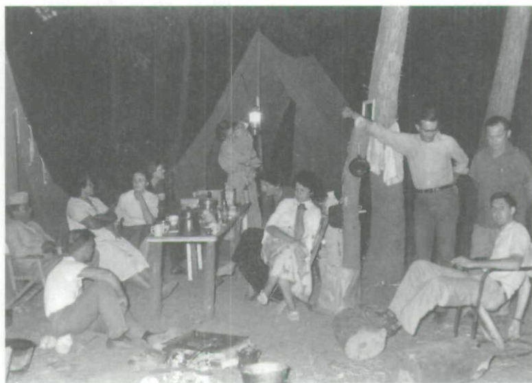
A Meskwaki couple socializes with a group of Chicago students around a campfire.

the women involved in the project. "I miss their friendship, just being able to talk with them and learning their side of the world, their travels," she said. 29