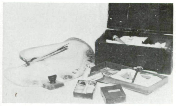
Shriner's palette and paint box; brushes are stuck through the thumb hole. Articles now owned by author.

So be it! But he's still "Pat" to the people of Fairfield and Iowa. To them, he's their own!