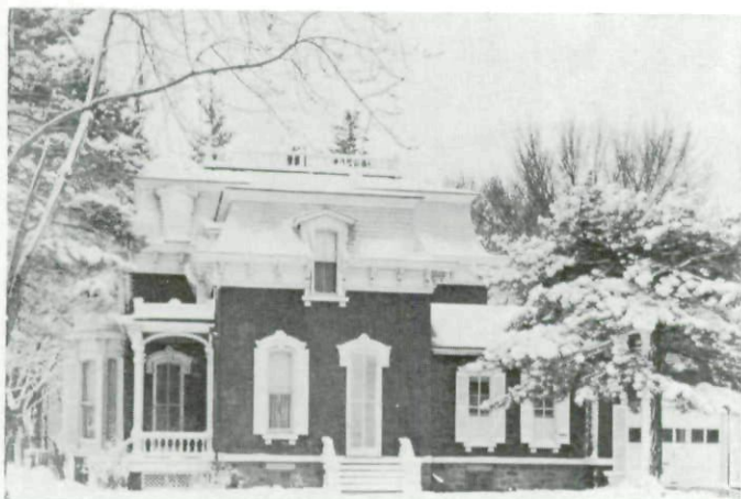
North elevation of home.

At one time the house had an interesting wooden front walk composed of 1½-inch wood strips spaced ½-inch apart, laid at right angles to the axis of the walk and painted white. It was shaped differently than the existing walk in that it consisted of an arc connecting the two entrances with a short connection to the front walk.