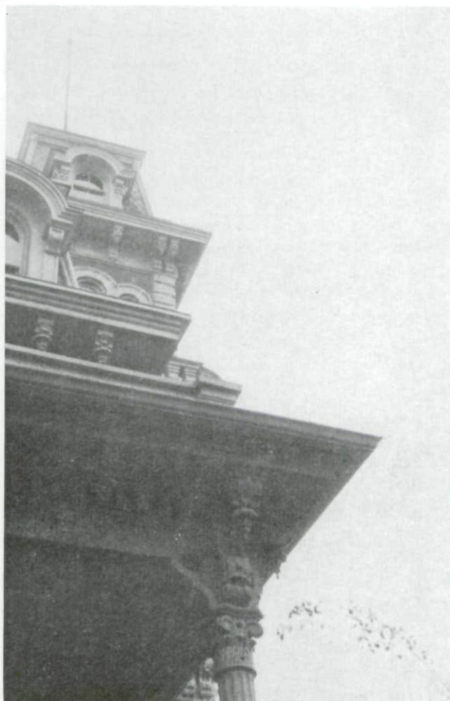
Series of projecting cornices to the ninety-foot tower.

staircase, which rises majestically from the end of the main hall to a broad landing beneath the great stained glass window before splitting into twin staircases to the second floor, is of oak, its balusters and rails of walnut and oak, and its hand-rail of highly polished rosewood.