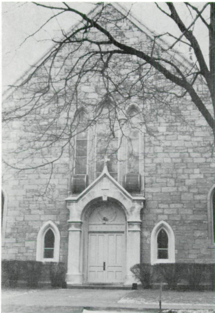
St. Irenaeus Church entrance.

Construction began in 1864 when the cornerstone was laid by Bishop Clement Smyth, then Bishop of the Diocese of Dubuque. Included in the cornerstone were two silver coins, a copy of the Lyons Mirror , and the names of the leaders of