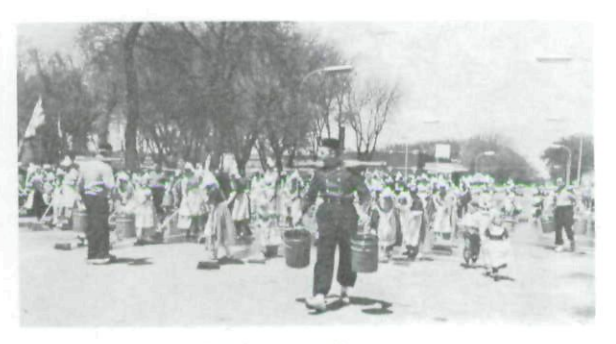
Dutch street cleaners.

monial functions have, throughout the 25 years, been carried out by City Officials and Iowa's Vice Council for the Netherlands, also a local citizen. With minor changes this ceremony is still considered one of the most colorful and impressive attractions of the Festival.