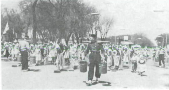
Dutch street cleaners.

monial functions have, throughout the 25 years, been carried out by City Officials and Iowa's Vice Council for the Netherlands, also a local citizen. With minor changes this ceremony is still considered one of the most colorful and impressive attractions of the Festival.