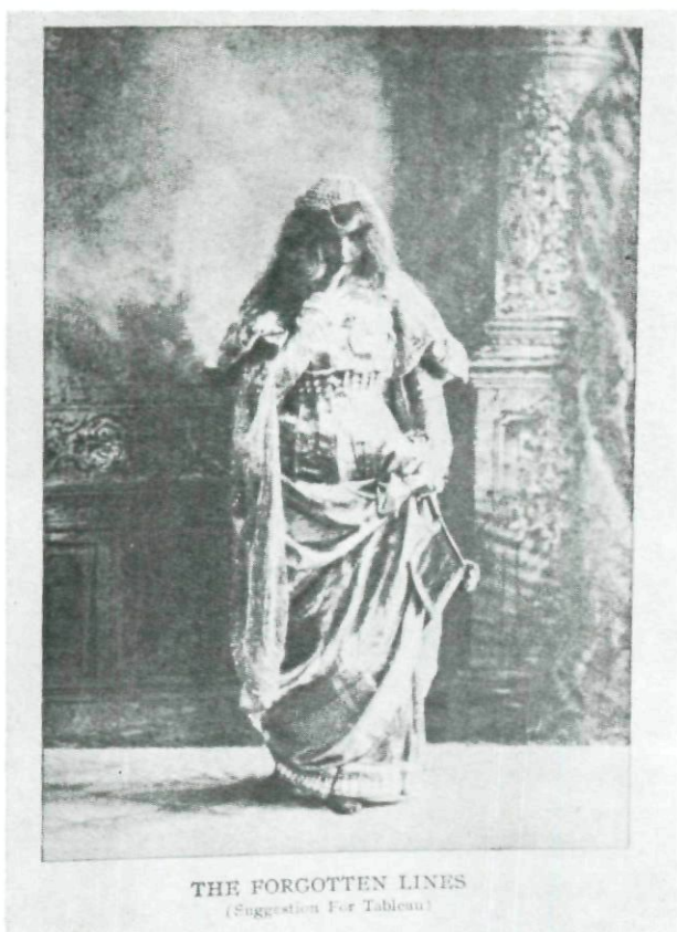
The Forgotten Lines

The "Literary Society" was the really big variety show of its day. It was live, it offered something for everyone and it invited audience participation. No wonder it flourished well into the 20th century. But on March 8, 1915, a rural newspaper correspondent had this to say in his weekly letter to the Washington Evening Journal : "There was not as good an attendance at Literary Friday evening as usual."