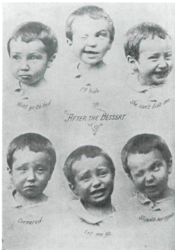
Expressions for Children

Parents, friends, we bid you welcome, To our school-room dear; And we join our loving voices Now to greet you here. If to-day mistakes we're making, Many failures, too, Oh! believe us, we have tried Our very best to do.