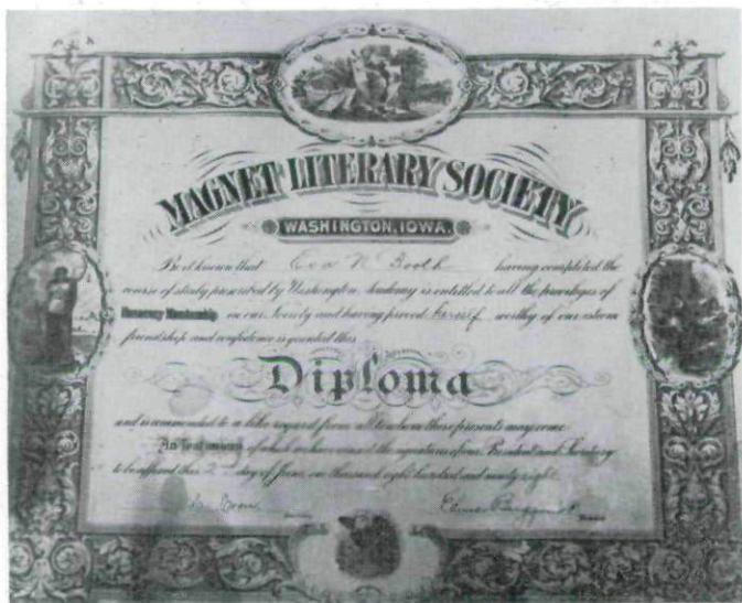
Diploma from the Magnet Literary Society

College and academy societies cultivated the ability to speak before an audience. Books were published to instruct the speaker; diplomas were awarded on the successful completion of courses in elocution.