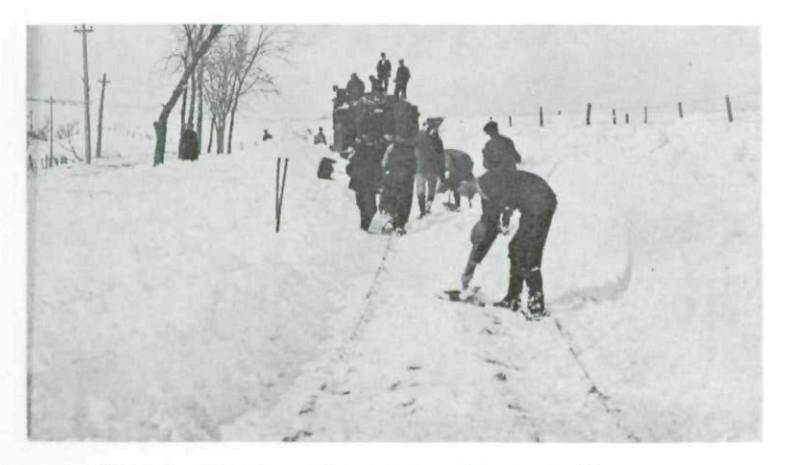
Farmers Along the Route of the Tabor and Northern Assist in Digging Out the Snowbound Train

The demand for passenger service began to decline even before the coming of the paved road. The ancient coach was abandoned in 1919, during my attendance at Tabor College Academy. The few passengers who patronized the line, including myself, were provided with boxes and barrels as seats in the freight car. A pot-bellied coal stove supplied heat in cold weather, after a fashion. Riding that little line that rolled and rocked through Mills County under such circumstances proved to be somewhat of a feat in gymnastics.