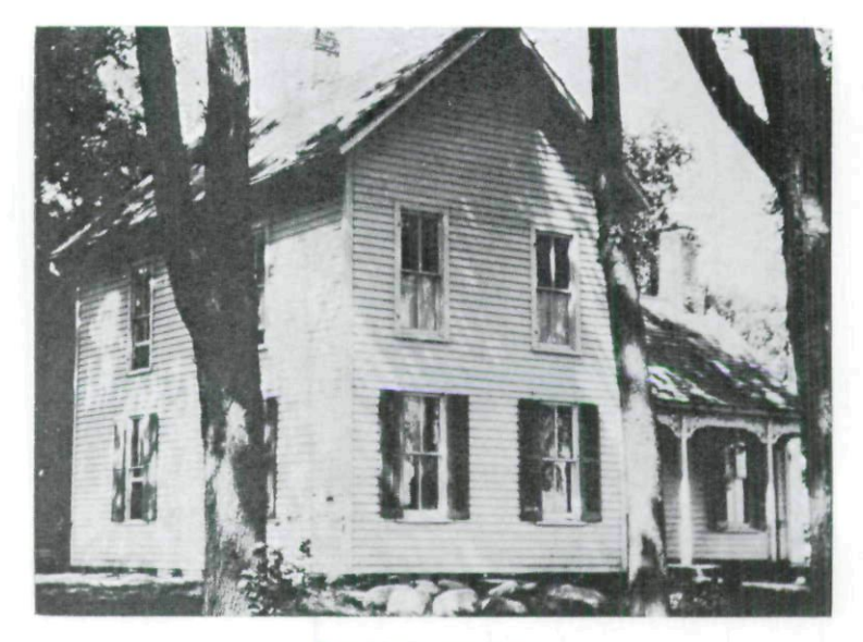
THE MCGRADY HOME

During the summer months many gypsys would pass through the countryside. These weary Jewish peddlars with packs on their backs usually carried many interesting things to sell. Mother would invite them in to spread out their wares, then she would buy a few items and serve them a snack. Some of the covered wagons that passed our farm were homesteaders with all their possessions heading for the Dakotas to take land. We welcomed the homesteaders, and they would unhitch and water their horses and then come into the house for food and sleep in their wagons in the barnyard.