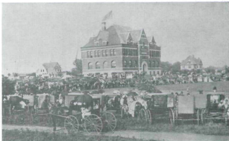
Baseball Days at Buena Vista College—1899