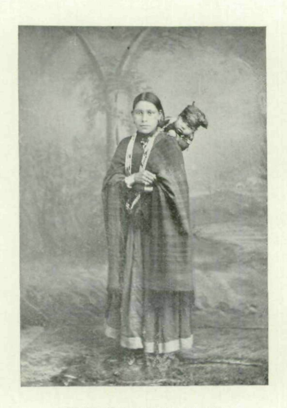
MUSQUAKIE SQUAW AND PAPOOSE.