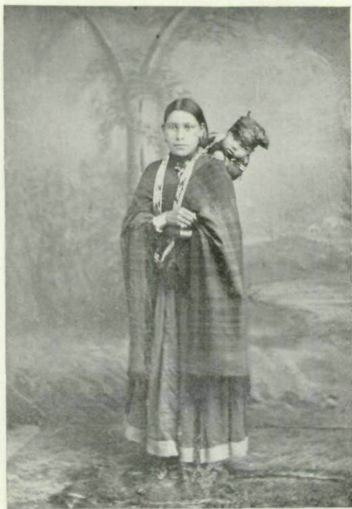
MUSQUARIE SQUAW AND PAPOOSE.