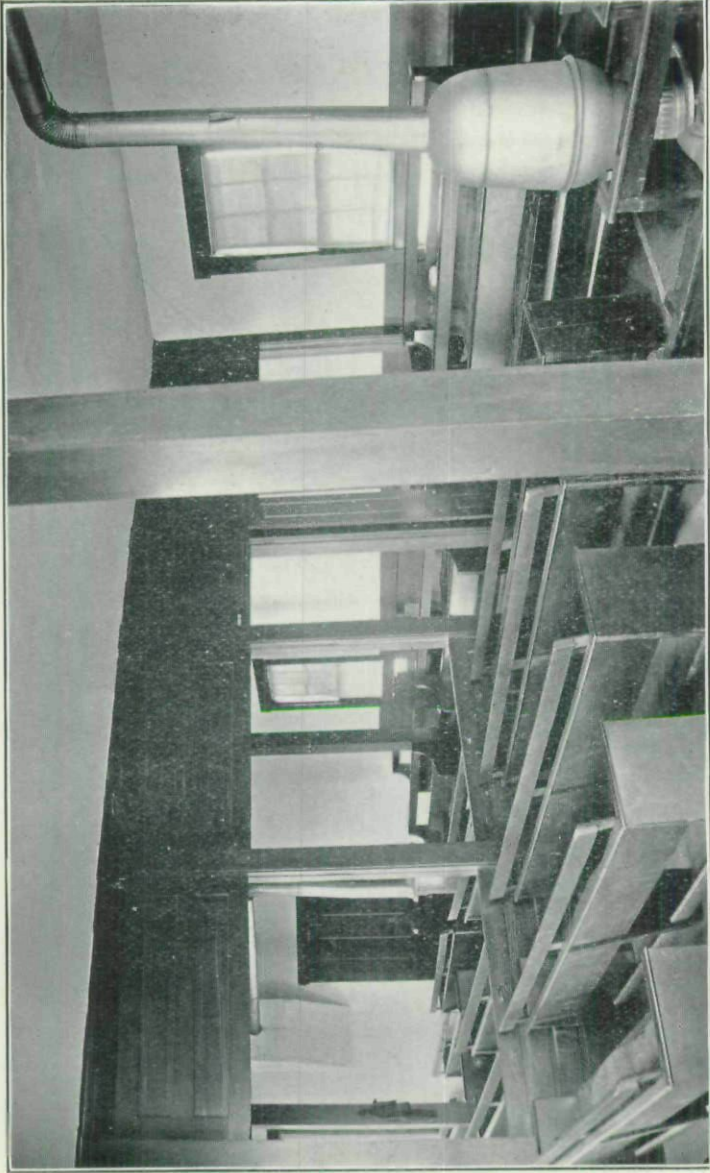
Interior of the Friends Meeting House at Hickory Grove, near West Branch, Cedar County, Iowa.