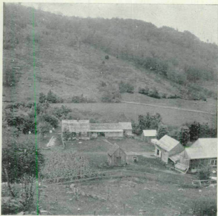
THE STEPHEN WHICHER FARM NEAR ROCHESTER, VERMONT.