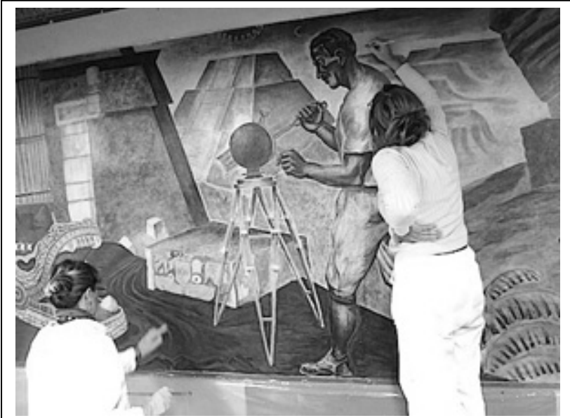
Figure 10. Inpainting Damage on WPA Mural in City Hall, Cedar Rapids.

the east wall of the mural. Although the city did not receive an award under that program, the NEA encouraged the GCRCF to submit a new proposal for consideration in a separate pool of funding. That alternate strategy was successful, and the city received notification of the grant award in August; however, the award amount of $20,000 was much smaller than the GCRCF had hoped. A private donor contributed significant funds to help make up the deficit, but the total still fell short of the $110,000 budget necessary to proceed with conservation work. The city of Cedar Rapids applied for additional assistance through the State Historical Society of Iowa's Historic Resource Development Program, which agreed to provide the remainder of the money. 81