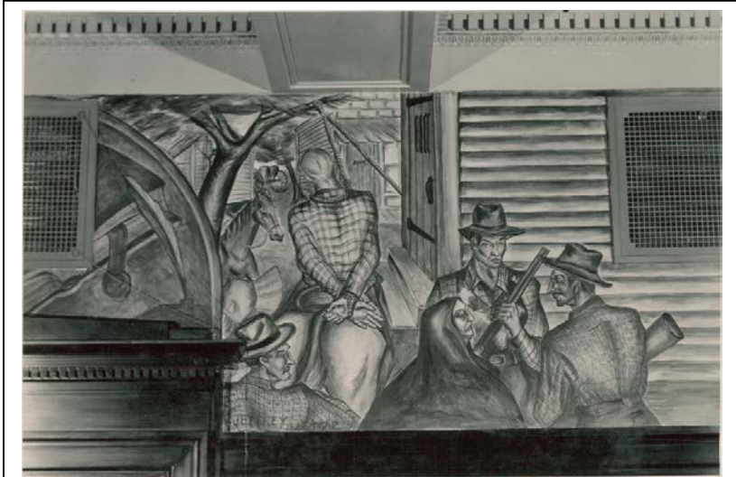
Figure 7. Everett Jeffrey, "Evolution of Justice" from Law and Culture , 1936–1937. Oil on canvas, Cedar Rapids Federal Courthouse (now Cedar Rapids City Hall), Cedar Rapids. Photograph No. 121CMS-8A-IO-6A, Photographs of Paintings and Sculptures Commissioned by the Treasury Relief Art Project, Records of the Public Buildings Service, Record Group 121-CMS, National Archives at College Park, College Park, Maryland.

a previous competition mural sketch. Titled "Pyre of Conquest: The Opening of the Middle West," the award-winning design illustrated the forced displacement of Native Americans and the early struggles of white pioneers on the frontier. 41 White planned to elaborate upon this scene by adding a steamboat, a tugboat, and an early railroad as symbols of territorial expansion; a mid-western farm as a symbol of established agrarian settlement; and