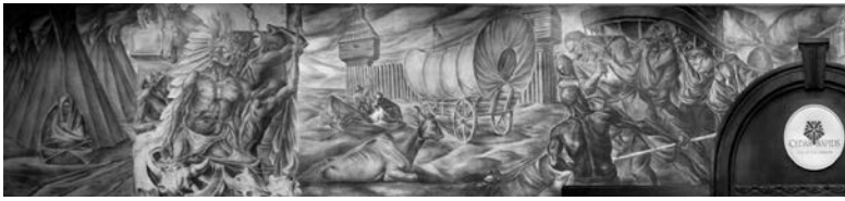
Figure 1 (cont. on facing page). Francis Robert White, Opening of the Midwest, 1936–1937. Oil on canvas, Cedar Rapids Federal Courthouse (now Cedar Rapids City Hall), Cedar Rapids.

that the offending imagery should be painted over. The mural was all but destroyed – covered and forgotten for decades, until the flood of 2008. Spurred to action by that natural disaster, the U.S. General Services Administration (GSA) worked quickly to prevent further damage to the historic artwork and to restore one wall of the mural to its original state. Additional preservation efforts on the part of the city of Cedar Rapids uncovered a second wall in 2013, and work on a third wall is currently under way.