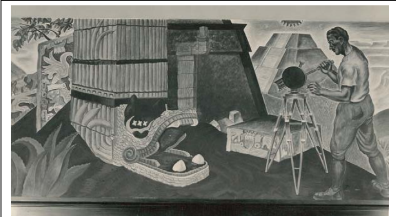
Figure 6. Harry Donald Jones, Our Inherited Culture from Law and Culture , 1936–1937. Oil on canvas, Cedar Rapids Federal Courthouse (now Cedar Rapids City Hall), Cedar Rapids. Photograph No. 121CMS-8A-IO-9B, Photographs of Paintings and Sculptures Commissioned by the Treasury Relief Art Project, Records of the Public Buildings Service, Record Group 121-CMS , National Archives at College Park, College Park, Maryland.

Jones's quotation of the Dartmouth College mural also acknowledges the aesthetic precedent behind the disjointed narrative and vivid color scheme evident throughout the CMP's design. The Cedar Rapids mural cycle exhibits the distinctive monumentality, bold outline, compositional movement, and roundness of form more typical of murals by Rivera and Orozco than of those by the artists' former mentor, Grant Wood. In addition, all of the walls employ a fluid montage of figures and episodes in the Mexican manner. By condensing past and present, history and fiction, the muralists achieved a dynamic composition that activates the public space as a site of historical memory. Viewers must make sense of the open-ended narrative sequence and, in doing so, reconcile the manifest social relations linking them not only to other