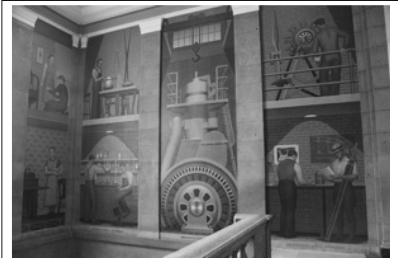
Figure 2. Grant Wood, "Engineering" from When Tillage Begins, Other Arts Follow, 1934-1935. Oil on canvas, Parks Library, Iowa State College (now Iowa State University), Ames, Iowa.