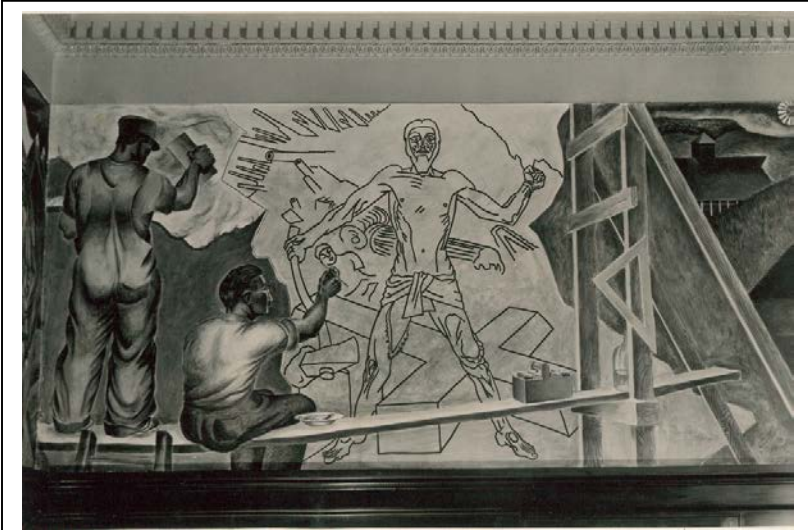
Figure 5. Harry Donald Jones, "Our Inherited Culture" from Law and Culture , 1936–1937. Oil on canvas, Cedar Rapids Federal Courthouse (now Cedar Rapids City Hall), Cedar Rapids.

alism by presenting episodes ranging from pre-Columbian antiquity and the Spanish Conquest to the modern militarized nation-state. 38 Perhaps inspired by this example, the adjacent vignettes in Jones's composition, titled "Our Inherited Culture" and "American Archaeological Research," foreground the rich cultural legacy of Native American civilizations in the New World (fig. 6). With this prominent inclusion of American archaeologists studying the cultures of ancient Mexico and the U.S. Midwest and Southwest, Jones promoted a multiethnic, inclusive definition of American identity and underscored his belief in the central role of art in revitalizing modern society. 39