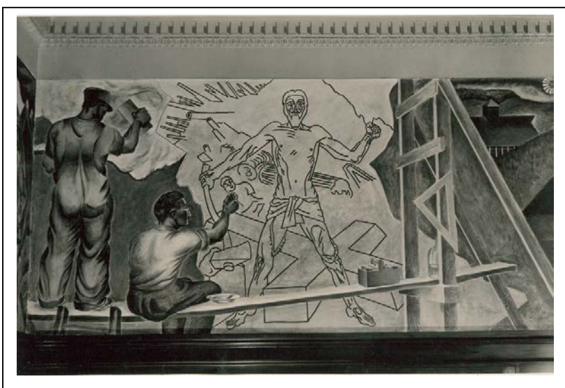
Figure 5. Harry Donald Jones, "Our Inherited Culture" from Law and Culture, 1936–1937. Oil on canvas, Cedar Rapids Federal Courthouse (now Cedar Rapids City Hall), Cedar Rapids.

alism by presenting episodes ranging from pre-Columbian antiquity and the Spanish Conquest to the modern militarized nation-state.<sup>38</sup> Perhaps inspired by this example, the adjacent vignettes in Jones's composition, titled "Our Inherited Culture" and "American Archaeological Research," foreground the rich cultural legacy of Native American civilizations in the New World (fig. 6). With this prominent inclusion of American archaeologists studying the cultures of ancient Mexico and the U.S. Midwest and Southwest, Jones promoted a multiethnic, inclusive definition of American identity and underscored his belief in the central role of art in revitalizing modern society.<sup>39</sup>