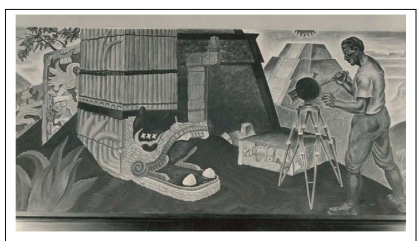
Figure 6. Harry Donald Jones, Our Inherited Culture from Law and Culture, 1936–1937. Oil on canvas, Cedar Rapids Federal Courthouse (now Cedar Rapids City Hall), Cedar Rapids. Photograph No. 121CMS-8A-IO-9B, Photographs of Paintings and Sculptures Commissioned by the Treasury Relief Art Project, Records of the Public Buildings Service, Record Group 121-CMS, National Archives at College Park, College Park, Maryland.

Jones's quotation of the Dartmouth College mural also acknowledges the aesthetic precedent behind the disjointed narrative and vivid color scheme evident throughout the CMP's design. The Cedar Rapids mural cycle exhibits the distinctive monumentality, bold outline, compositional movement, and roundness of form more typical of murals by Rivera and Orozco than of those by the artists' former mentor, Grant Wood. In addition, all of the walls employ a fluid montage of figures and episodes in the Mexican manner. By condensing past and present, history and fiction, the muralists achieved a dynamic composition that activates the public space as a site of historical memory. Viewers must make sense of the open-ended narrative sequence and, in doing so, reconcile the manifest social relations linking them not only to other