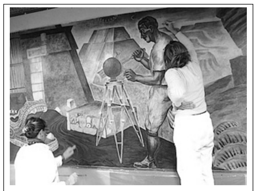
Figure 10. Inpainting Damage on WPA Mural in City Hall, Cedar Rapids.

the east wall of the mural. Although the city did not receive an award under that program, the NEA encouraged the GCRCF to submit a new proposal for consideration in a separate pool of funding. That alternate strategy was successful, and the city received notification of the grant award in August; however, the award amount of $20,000 was much smaller than the GCRCF had hoped. A private donor contributed significant funds to help make up the deficit, but the total still fell short of the $110,000 budget necessary to proceed with conservation work. The city of Cedar Rapids applied for additional assistance through the State Historical Society of Iowa's Historic Resource Development Program, which agreed to provide the remainder of the money.<sup>81</sup>