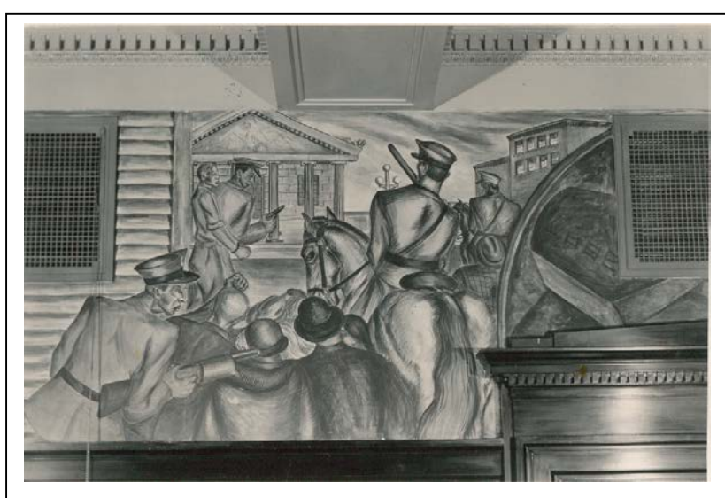
Figure 8. Everett Jeffrey, "Evolution of Justice" from Law and Culture, 1936–1937. Oil on canvas, Cedar Rapids Federal Courthouse (now Cedar Rapids City Hall), Cedar Rapids. Photograph No. 121CMS-8A-IO-6B, Photographs of Paintings and Sculptures Commissioned by the Treasury Relief Art Project, Records of the Public Buildings Service, Record Group 121-CMS, National Archives at College Park, College Park, Maryland.

Although White's labor activism and open hostility to Wood earned him a reputation among much of the Iowa art community as a "radical" and "left-wing" artist, he considered himself nothing more than an ardent New Dealer. As he later put it, "I agreed very much with the philosophy of those days. It was very stimulating because for the first time artists became public figures. They worked with the community on public buildings and tried to give a medical, social and humanitarian message to the people of the United States. They became spokesmen . . . in the sense that they symbolized the New Deal in their art." 47