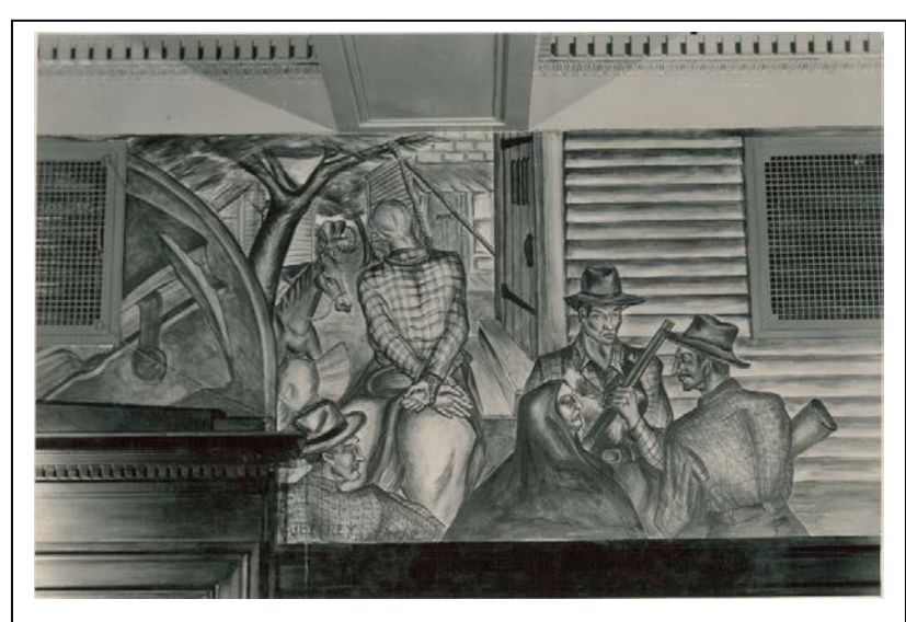
Figure 7. Everett Jeffrey, "Evolution of Justice" from Law and Culture, 1936–1937. Oil on canvas, Cedar Rapids Federal Courthouse (now Cedar Rapids City Hall), Cedar Rapids. Photograph No. 121CMS-8A-IO-6A, Photographs of Paintings and Sculptures Commissioned by the Treasury Relief Art Project, Records of the Public Buildings Service, Record Group 121-CMS, National Archives at College Park, College Park, Maryland.

a previous competition mural sketch. Titled "Pyre of Conquest: The Opening of the Middle West," the award-winning design illustrated the forced displacement of Native Americans and the early struggles of white pioneers on the frontier. <sup>41</sup> White planned to elaborate upon this scene by adding a steamboat, a tugboat, and an early railroad as symbols of territorial expansion; a midwestern farm as a symbol of established agrarian settlement; and