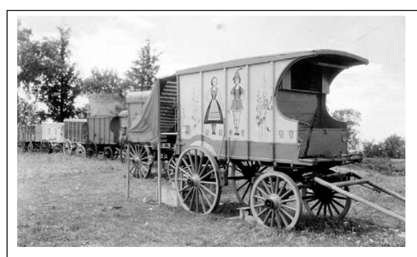
Wagons at the artist camp at the Stone City Art Colony.

and the like worked to emphasize the difference—the otherness—of the artists and their colony. So too, did journalists' concern with the appearance and dress of the artists themselves.