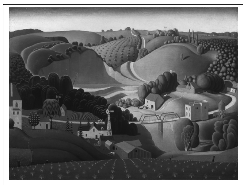
Grant Wood, Stone City, 1930. Art © Figge Art Museum, successors to the Estate of Nan Wood Graham/Licensed by VAGA, New York, NY.

meaning: the billboard facing the painting's audience displays the faint image of a man in a red tie—a 1930s urban sartorial code for male homosexuality—smoking a cigarette, with copy that suggestively reads: "They Satisfy." <sup>37</sup>