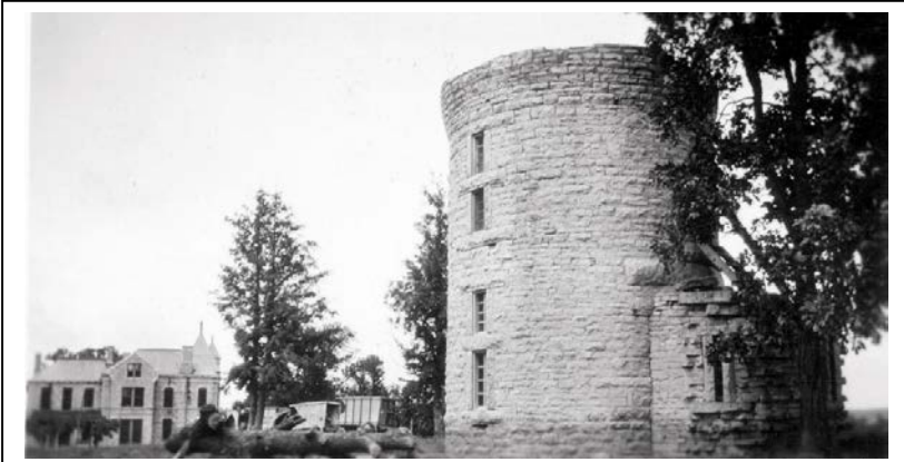
The stone tower at the Stone City Art Colony stands in the foreground, with the Green mansion in the background.

defined lines. The other ice wagon residents followed suit—in form, if not in style—adorning the interior and exterior of their wagons to suit their artistic whims (the interior of Wood’s was sleek metallic silver). 4