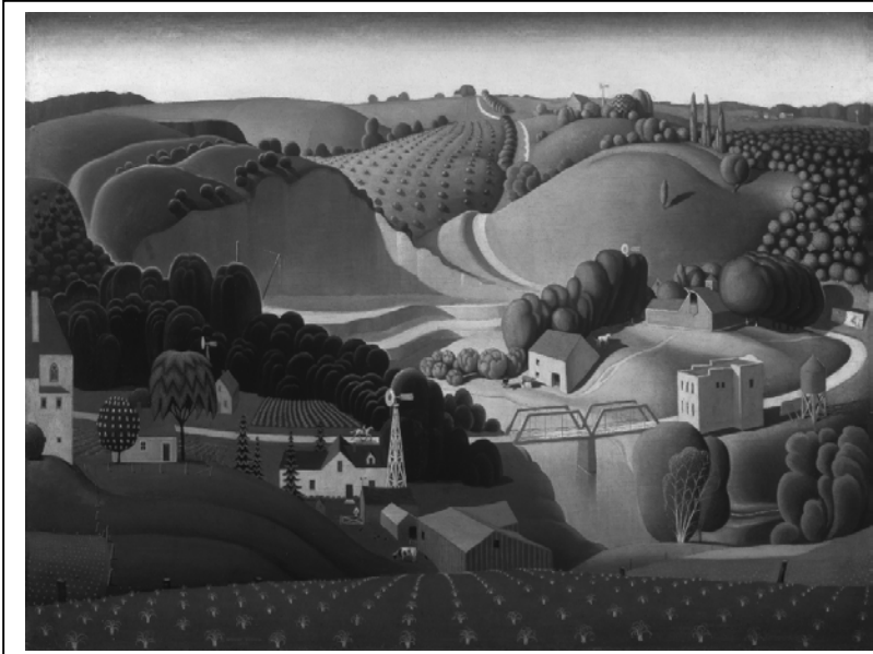
Grant Wood, Stone City, 1930. Art © Figge Art Museum, successors to the Estate of Nan Wood Graham/Licensed by VAGA, New York, NY.

meaning: the billboard facing the painting's audience displays the faint image of a man in a red tie—a 1930s urban sartorial code for male homosexuality—smoking a cigarette, with copy that suggestively reads: "They Satisfy." 37