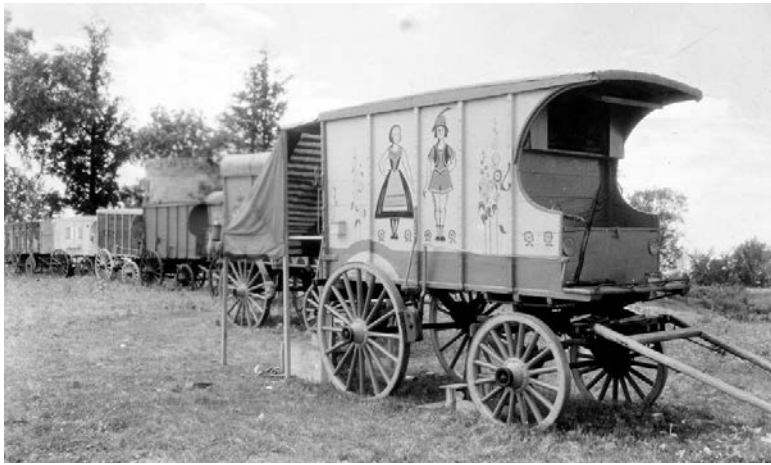
Wagons at the artist camp at the Stone City Art Colony.

and the like worked to emphasize the difference — the otherness — of the artists and their colony. So too, did journalists' concern with the appearance and dress of the artists themselves.