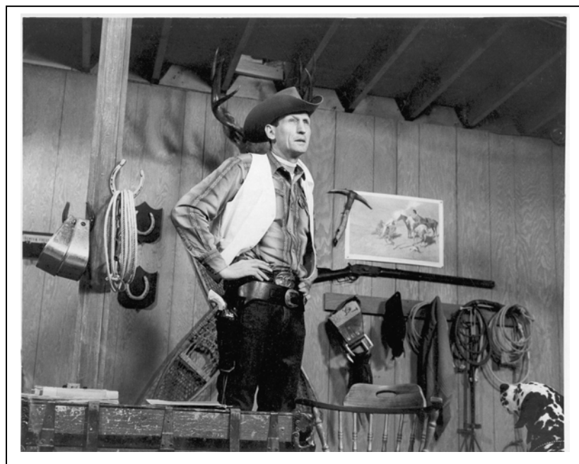
All of the items displayed in the tack room set were authentic.