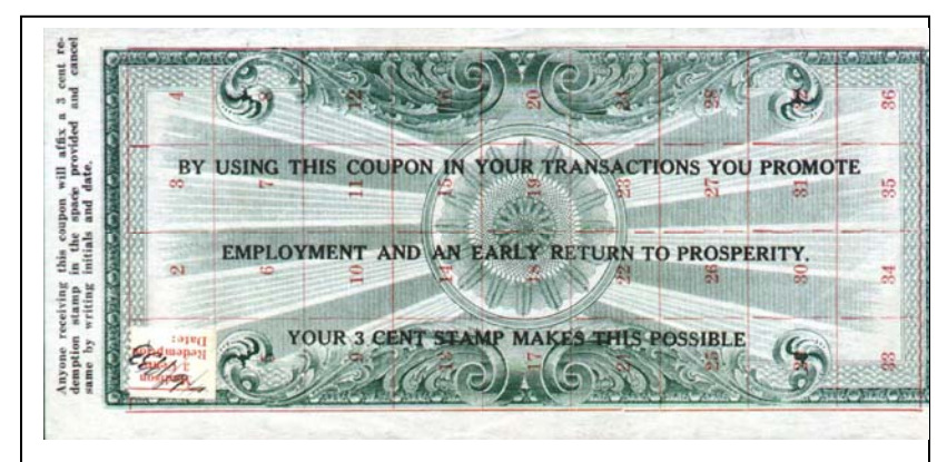
Back of scrip note from Madison, South Dakota.

The Hawarden plan was launched in October 1932, when the first group of unemployed men (all heads of household) received $1.60 for a day's labor on projects for the city. This sum comprised 60 cents in cash and a one-dollar scrip certificate that could be used in local stores to purchase groceries or other necessities. To be valid, the certificate needed to have a three-cent stamp attached each time it was used.