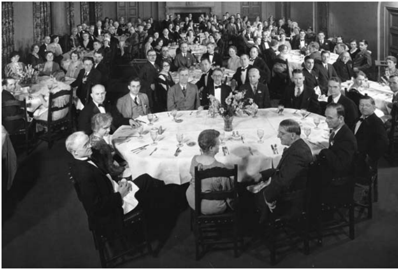
The MVHA met in Lincoln, Nebraska, in 1932.

organizers of the MVHA worked diligently to attract historians at regional universities such as Minnesota, Kansas, Nebraska, Michigan, Missouri, Iowa, Cincinnati, and Chicago. 60 The Prairie Historians also tried to keep the presidency of the MVHA in the hands of scholars who focused on western history. 61 Alvord thought the MVHA would become a “laughing stock” by going “so far afield as to elect a modern history scholar for our presi-