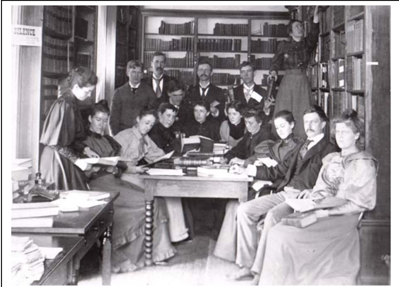
Frederick Jackson Turner conducted his American history seminar in an alcove of the Wisconsin Historical Society's library in the State Capitol. Turner is second from the right in the front row.