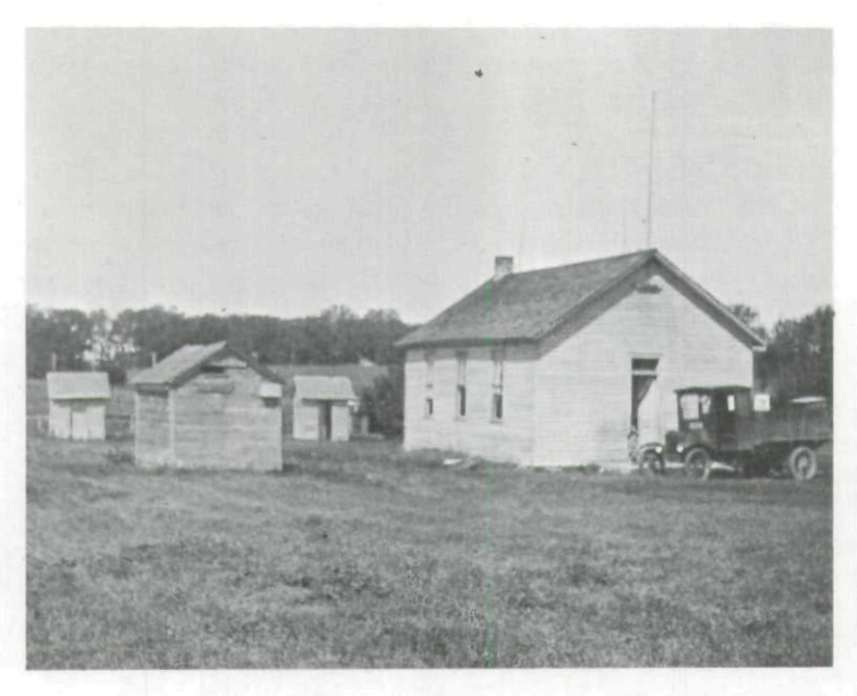
District School #2, Clinton Township, Sac County. Photo taken in 1922.

as "Tenting Tonight on the Old Camp Ground," "O Columbia, the Gem of the Ocean," and several of Stephen Foster's plaintive songs as "My Old Kentucky Home." Some of the songs, such as "Kind Words Can Never Die," and some of the mottoes in our copy books as "Kindness is to do and say the kindest things in the kindest way," were evidently aimed to inculcate high ideals of conduct.