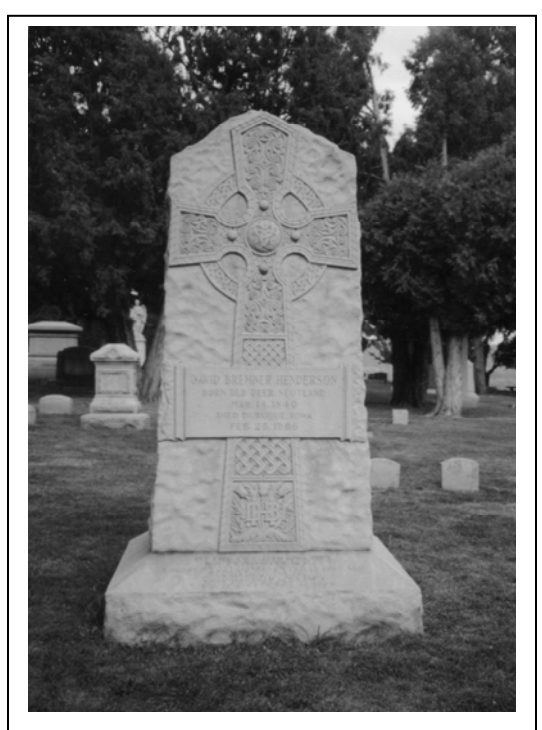
This massive stone in Linwood Cemetery in Dubuque is the final resting place of the first Speaker of the House from west of the Mississippi River.

Henderson as a battlefield preservationist can be viewed as a case study of the entire generation of Civil War veterans. His major support for only the Army of the Tennessee's battlefields illustrates the grassroots mentality and disjointed nature of the phenomenon, and the lack of a centralized source of support for the effort. And just as Henderson's early support for establishing the parks began to wane in the 1890s as more and more parks came about and as the price tag grew, so too did the Civil War veteran generation's lobbying efforts decline. By the first years of the twentieth century, Civil War veterans did not seem quite