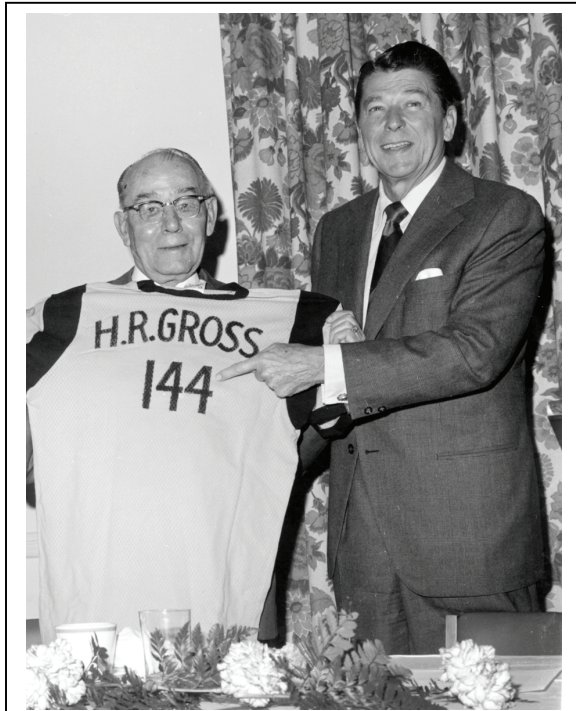
At a meeting of the Bull Elephant Club in 1974, former broadcasting colleague and then Governor of California Ronald Reagan presented Gross with a shirt bearing the logo "H.R. Gross 144."

eral program of fiscal restraint. More fundamentally, House Republicans were the minority party for almost all of Gross's tenure. During his 13 terms, Republicans controlled the chamber only from 1952 to 1954. That impeded Gross's ability to sponsor or back successful legislation. Finally, Gross was truly a singular voice. Indeed, he appeared to revel in such a status; one author noted that Gross seemed to cultivate the image of a loner by choice. The status of an isolated, rank and file, minority party member is not a recipe for influence in the U.S. House of Representatives. 57