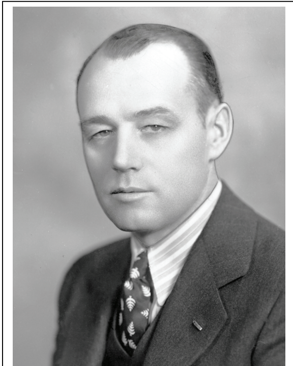
This portrait of H. R. Gross appeared in the Des Moines Register in 1940, at the time the paper reported that Gross had filed to run for the Republican nomination for governor.

he would later show in Congress: a fierce independence and a contrary – even conflictual – relationship with his own party.