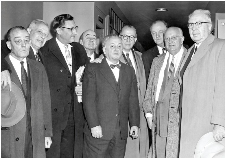
The Iowa congressional delegation (with Gross on the left) posed with Secretary of Agriculture Ezra Taft Benson on the day President Eisenhower delivered his farm message to Congress. Gross was not pleased.

farm program, and of the president himself for retaining Secretary of Agriculture Ezra Taft Benson in the face of Republican congressional criticism. When Eisenhower responded that “those who head the various executive departments, once having been appointed, are no longer the concern of Congress,” Gross accused the president of “treading dangerously close to autocratic rule.” 19