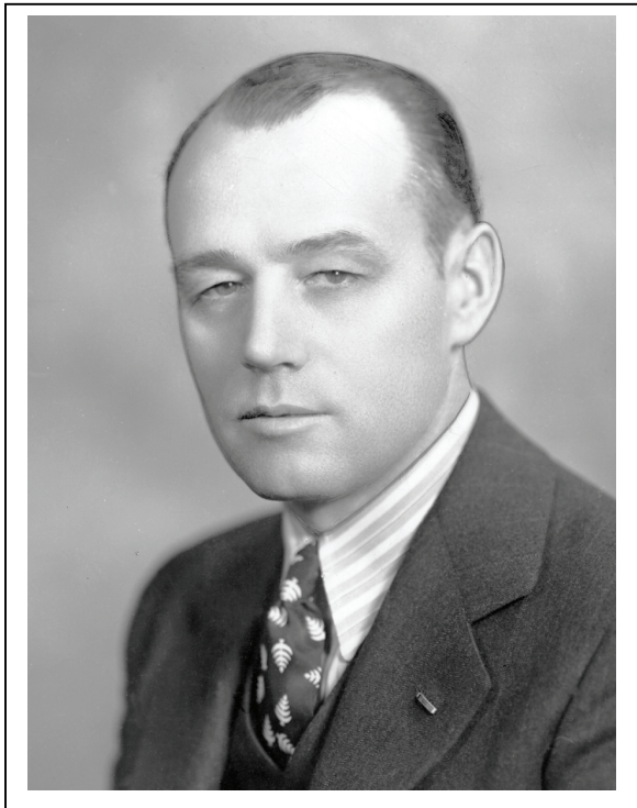
This portrait of H. R. Gross appeared in the Des Moines Register in 1940, at the time the paper reported that Gross had filed to run for the Republican nomination for governor.

he would later show in Congress: a fierce independence and a contrary – even conflictual – relationship with his own party.