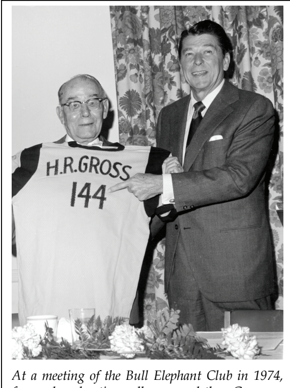
former broadcasting colleague and then Governor of California Ronald Reagan presented Gross with a shirt bearing the logo "H.R. Gross 144."

eral program of fiscal restraint. More fundamentally, House Republicans were the minority party for almost all of Gross's tenure. During his 13 terms, Republicans controlled the chamber only from 1952 to 1954. That impeded Gross's ability to sponsor or back successful legislation. Finally, Gross was truly a singular voice. Indeed, he appeared to revel in such a status; one author noted that Gross seemed to cultivate the image of a loner by choice. The status of an isolated, rank and file, minority party member is not a recipe for influence in the U.S. House of Representatives.<sup>57</sup>