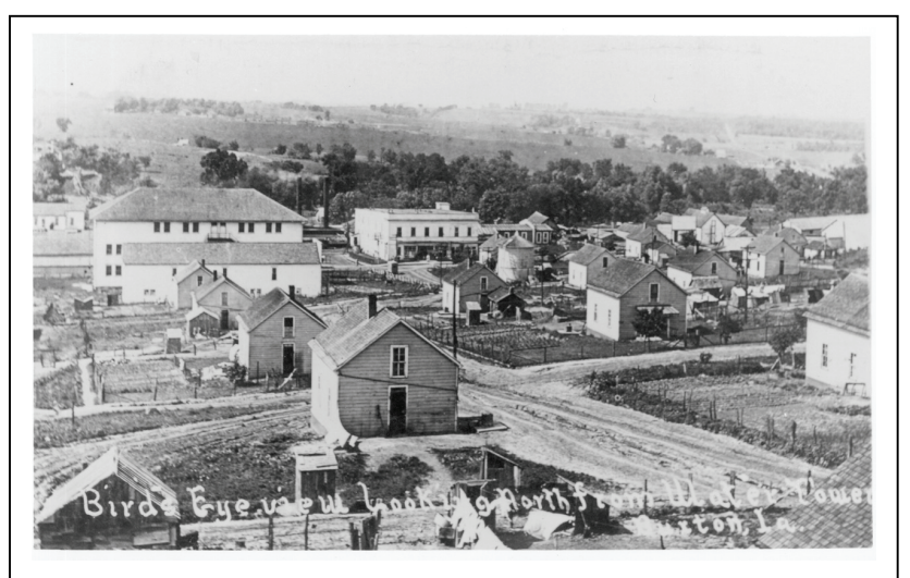
Bird's-eye view of Buxton, ca. 1919, looking north from the water tower.

total population of 5,000 in 1905, 2,700 were black.<sup>13</sup> The migration of African Americans to Buxton, like that to coal mines in West Virginia, "was neither rural to urban nor rural to rural, but rather rural to rural-industrial."<sup>14</sup> African Americans who migrated to Buxton from states such as Virginia, Missouri, Alabama, and Tennessee often forged new class alliances that crossed racial lines and created an atmosphere based on racial cooperation and mutual respect.