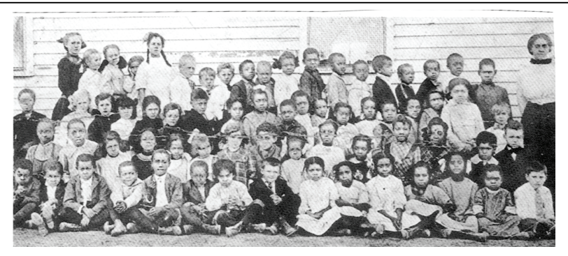
A class picture from Fifth Street Elementary School, about 1912, showing 48 black students and 20 white students.

can teachers taught in racially integrated schools in Buxton, much of the evidence suggests that white teachers taught in the predominantly white school and black teachers taught in mostly black schools.<sup>30</sup> Reports of black and white teachers in the same school were probably more the case with Fifth Street and Eleventh Street schools and not Swedetown.