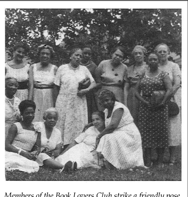
Members of the Book Lovers Club strike a friendly pose.

For the Book Lovers, though, possibly of equal importance was the fact that the members were all black—a condition that the YWCA not only facilitated in the 1930s and early 1940s but demanded. That was about to change, however. After World War II, pressure from African Americans finally convinced both the national YMCA and the YWCA to pass a resolution urging white associations to end Jim Crow segregation. In 1946 the YWCA's National Association adopted an "Interracial charter" abolishing segregated YWCAs across the country.<sup>41</sup>