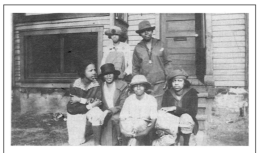
A group of young women pose in front of the building on 10th Street in Des Moines used in the 1920s for the segregated branch of the YWCA.

– was "always available for use of groups in the Negro community." The programs themselves provided "Negro women and girls community contacts where they are people rather than members of a minority group." Staffed by a secretary and 137 volunteers, the house included "dormitory space for three girls," as well as room for a range of activities that reached more than 400 people in 1938. Those activities included not only the weekly meetings of the Book Lovers' Club, but religious services, a weekly chorus, meetings of three "Girl Reserve Clubs," youth forums on "Social Disease, Vocations, Education for Marriage, etc.," and classes in interior decorating, handcraft, basketball, badminton, and "Parliamentary Usage."<sup>14</sup>