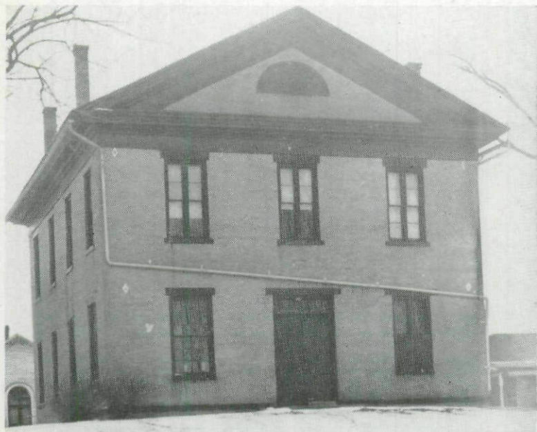
VAN BUREN COUNTY COURT HOUSE