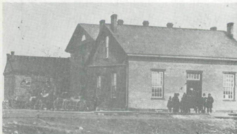
COURT HOUSE AND COUNTY BUILDINGS