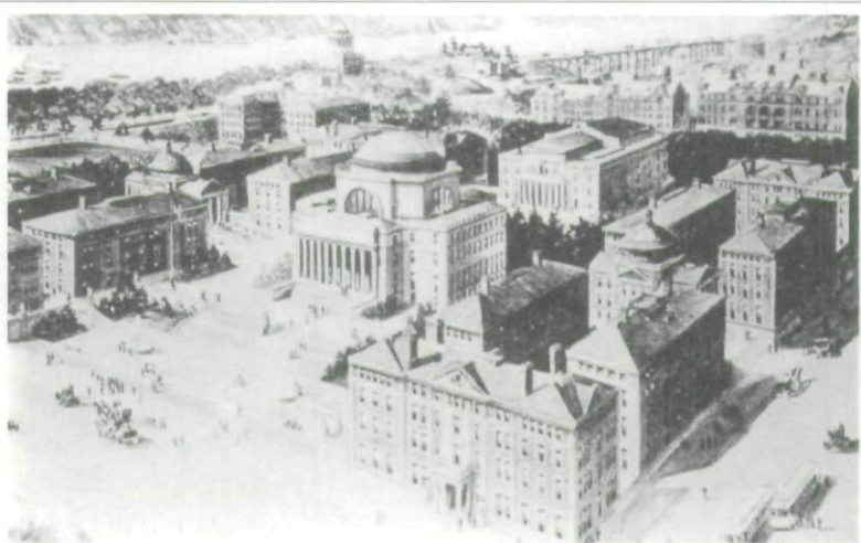
Fig. 4. Columbia University, 1894. Reprinted from Moses King, King's New York Views (New York, 1905).

needed. These new universities would have larger numbers of students with a corresponding need for more and different kinds of academic departments, housing facilities, libraries, and even museums.