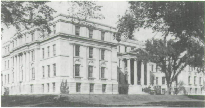
Fig. 9. Schaeffer Hall, 1898–1902.

alumni circulated petitions. "Save the Campus!" became the undergraduate battle cry, and a local newspaper editor echoed their theme. "The campus is a beautiful plot of ground," he wrote, "and to mutilate it seems almost a desecration to our people and the alumni, particularly as there is no need in so doing." 21 This editor and others insisted that the board should adhere to the former Victorian landscape plan. That would have required that any new buildings be erected in a line with or behind Old Capitol, on the sites of several older buildings (including South Hall, North Hall, and the Medical Building, all of which were in various states of disrepair).