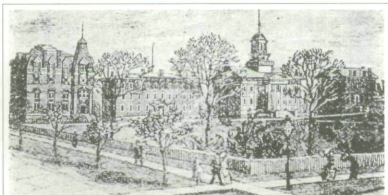
Fig. 7. Print of Old Capitol area, c. 1890.

Also present in the earlier Victorian campus were cinder walks lined with locust trees, a rustic stone fountain, and a greatly prized one-hundred-year-old oak tree (fig. 8). The emphasis on large green spaces reflected Iowa's cherished rural values. 15 These open areas were not simply backdrops for architecture; they were prized in and of themselves as settings for walks and traditional May breakfasts. So by the 1890s, when the new monumental scheme was being considered, a distinct visual tradition was already in place on the Iowa campus. The Beaux-Arts scheme's challenge to that visual tradition, with its encroachment on the campus's green space, soon sparked public opposition.