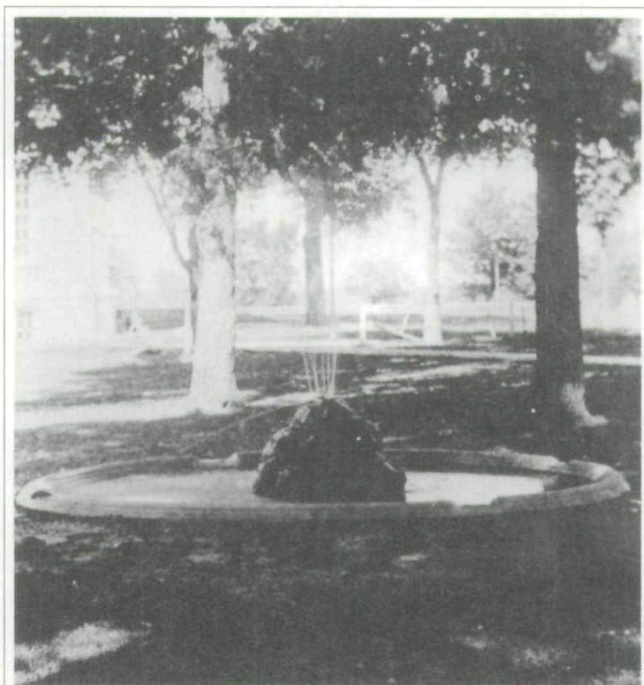
Fig. 8. Fountain, Old Capitol area, c. 1890.

their facilities, and as Paul Turner has shown in his study of campus design, that approach was also a common European Beaux-Arts practice. 16