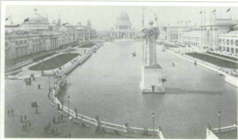
Fig. 3. Columbian Exposition, Chicago, 1893.

tral domed building, and all lit by a new technological marvel, electric lights, creating glittering reflections in the lagoon (fig. 3). For most Americans, it was a novel visual experience to see the dignity and beauty of a unified and complete "city" plan, with squares, boulevards, lagoons, and plazas all electrically illuminated and landscaped. The Exposition helped change the architectural taste of the nation, and it also provided the impetus for modern city planning through the City Beautiful Movement. 4