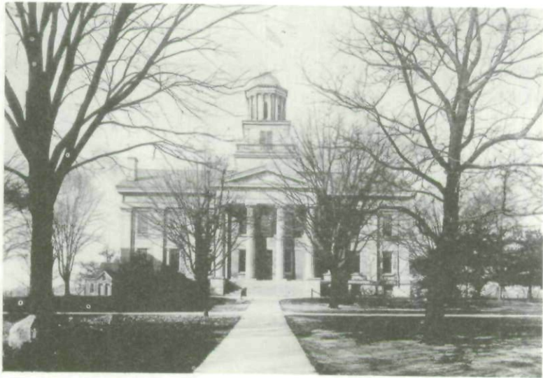
Fig. 2. Old Capitol, 1840.

THE BEAUX-ARTS MODE OF DESIGN (or "Beaux-Arts Classicism" as some style books term it) derived its name from the famous Parisian school of architecture where it was origi-