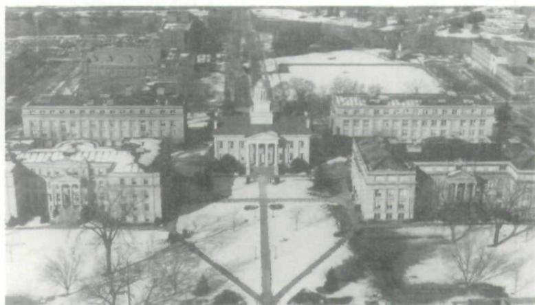
Fig. 1. The Pentacrest, 1898–1924. View to the west showing Old Capitol at center and, clockwise from lower left: Schaeffer, MacLean, Jessup, and Macbride halls.

ings, all designed by the Des Moines architectural firm of Proudfoot and Bird, were constructed by the university over the years extending from 1898 to 1924. 1