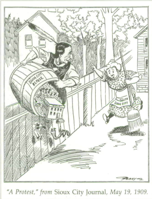
"A Protest," from Sioux City Journal, May 19, 1909.

the injunctions he received as owner of a house of prostitution. More important, he planned a new hotel for the site. 33