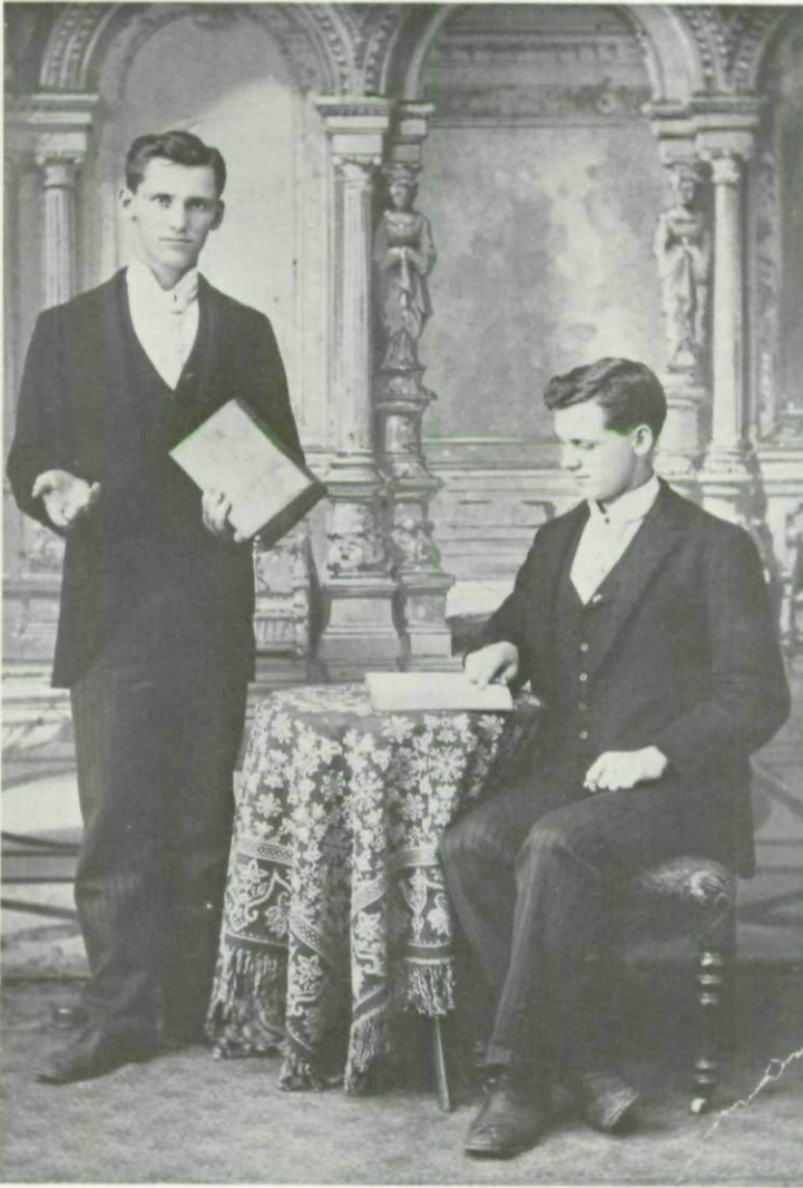
Smith Wildman Brookhart, ca. 1890. (In this trick photograph, both figures are Brookhart.)

The problem, then, was how to reorient the party away from the rigid and unrealistic dry position and thus win back the wandering moderates and with them the statehouse.