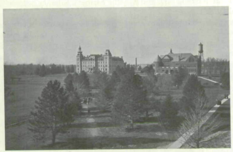
Iowa State Agricultural College campus, Ames, circa 1890s.

terned its development after the majority of land-grant colleges: gradually broadening its curriculum while simultaneously cutting back agriculture-related work. But this reduction of agricultural emphasis encountered strong opposition from the Iowa Farmer's Alliance. With the aid of the Iowa Homestead , the leading farm journal in the state, and other Iowa farm organizations, the Farmer's Alliance persuaded the college faculty and the Board of Trustees to reinstate a strong agriculture course. This change, effected only after a long and bitter debate, resulted in the hiring of a new college president and professor of agriculture. Most importantly, it represented a unique instance when the Farmer's Alliance took an active role in shaping academic policy at a land-grant college.<sup>4</sup>