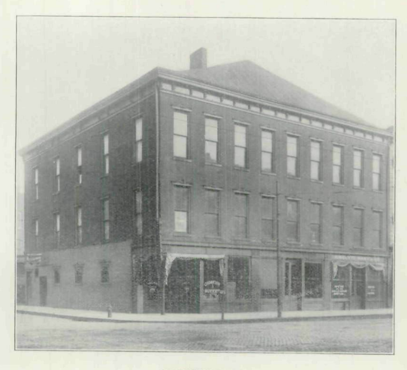
SHERMAN'S HALL, Third Street and Court Avenue.

Meeting place of Republican State Convention, Des Moines, Iowa, Jan. 18, 1860. (Photographed October, 1910.)