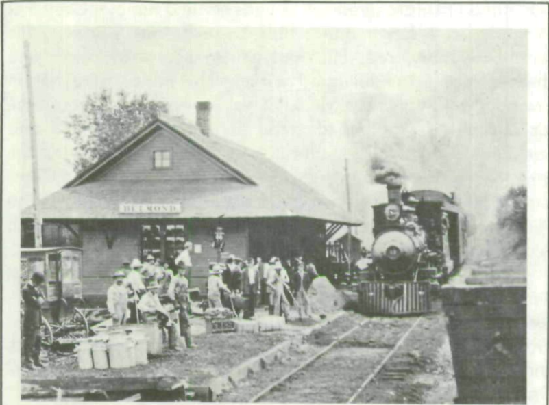
A Mason City & Fort Dodge passenger train steams into Belmond near the turn of the century.

Manly Junction to Mason City, and it could also connect with a twenty-seven mile addition from Hampton to Clarion. 13