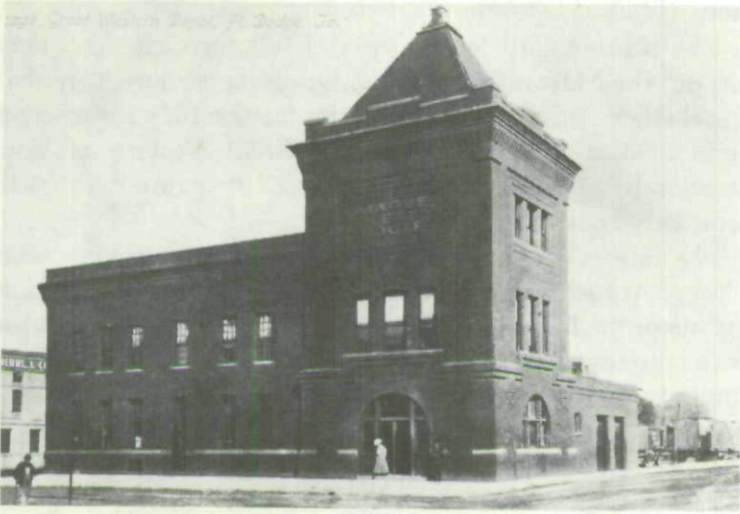
A leading symbol of Chicago Great Western ownership of the Mason City & Fort Dodge is the substantial passenger station it erected in Fort Dodge in 1905.

to acquire a twenty percent interest in the Kansas City Southern. In order to avoid an Illinois law that forbade any locally chartered railroad from acquiring stock in a connecting carrier of another state unless it purchased at least two-thirds of its securities (the CGW was an Illinois company, the Kansas City Southern a Missouri one, and they interchanged at Kansas City), the Mason City & Fort Dodge entered into the deal as the purchaser. As a later Senate investigation of the Great Western revealed, "The whole intercompany transaction was a subterfuge, the subsidiary [MC&FD] acting merely as a nominee for the Great Western." Added the report: "The Mason City performs practically no ordinary corporate function. Not only are all of its stocks and most of its bonds owned by the Great Western, but its entire property is operated by the parent road under a hundred-year lease. As rent, the parent company pays interest, when earned, on the Mason City bonds." It concluded with this observation: "Since most of these bonds are owned by the Great Western, and since the latter also